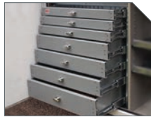
STEEL MECHANIC DRAWERS