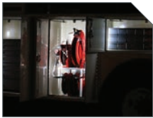
LED COMPARTMENT LIGHTS