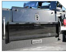
TELESCOPIC SLIDING ROOF (TSR)