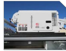
AUXILIARY POWER UNIT (APU)