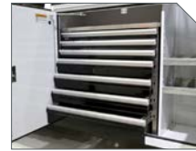
ADDITIONAL MECHANIC DRAWERS