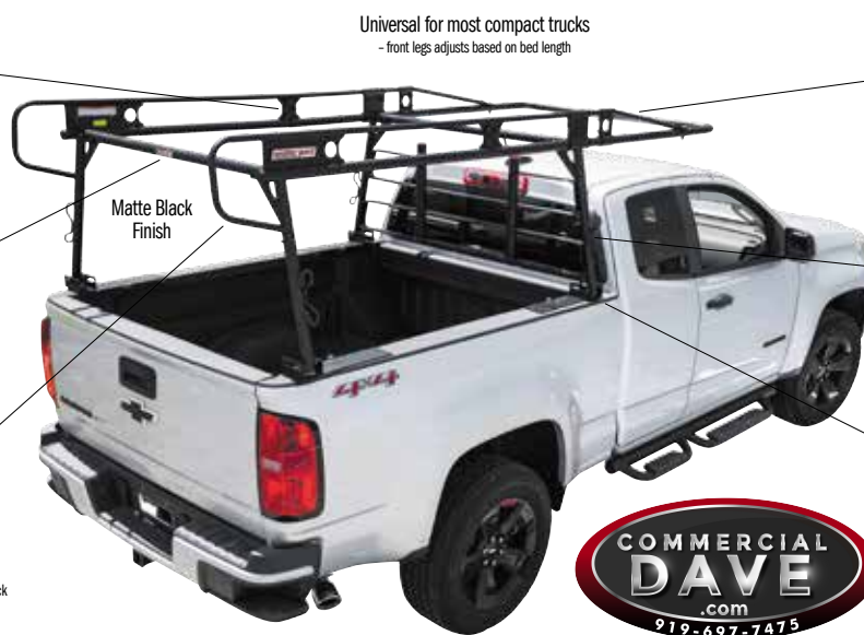
Universal for most compact trucks - front legs adjust based on bed length