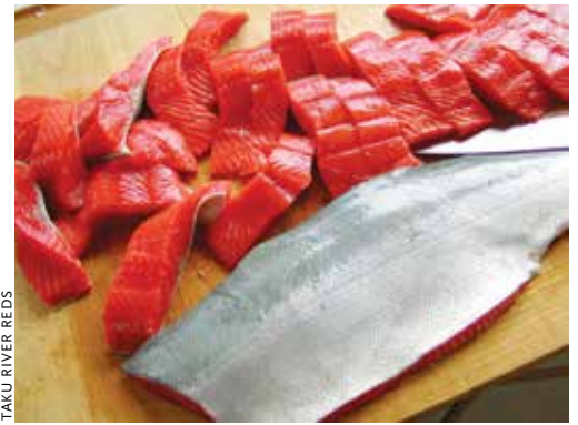
TAKU RIVER REDS

Copper River • Denali • Fairbanks • Kenai • Mt. McKinley