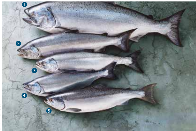
North Pacific salmon species: 1) king; 2) silver; 3) chum; 4) pink; 5) sockeye.

which species of salmon you like best, caught when and cooked how. In Bristol Bay, Valdez, Homer, Juneau, Sitka, Fairbanks and across the state, similar divisions pertain.