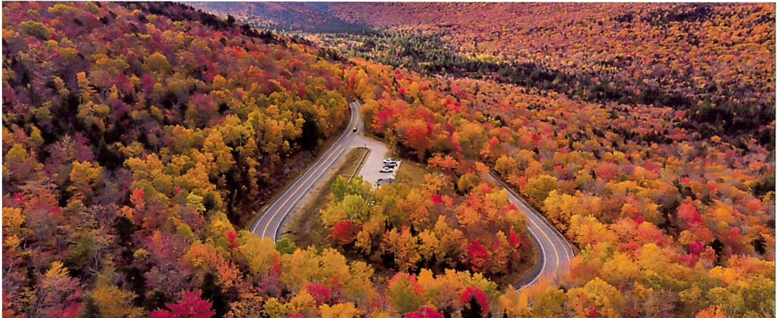
Travel the Kancamagus Scenic Byway as it follows a beautiful path through the White Mountains

such as Harwich with its miles of sandy beaches and lush cranberry bogs, Orleans with the natural beauty of its forests and the summer vacation community of Truro. Enjoy lunch in Provincetown, a once bustling whaling town with a connection to Pilgrim and American history. Meals: B, L