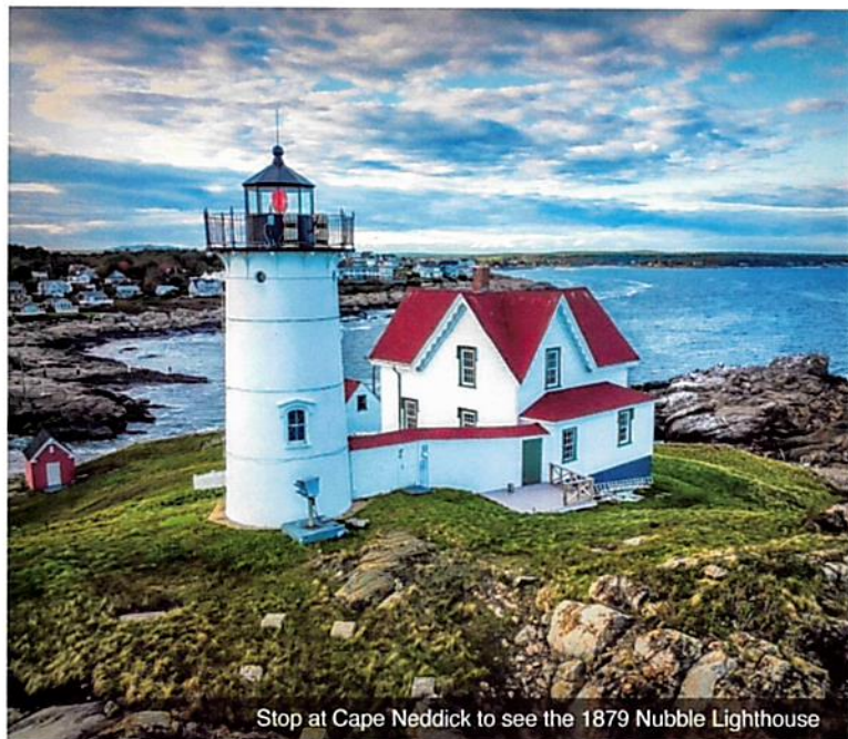
Stop at Cape Neddick to see the 1879 Nubble Lighthouse