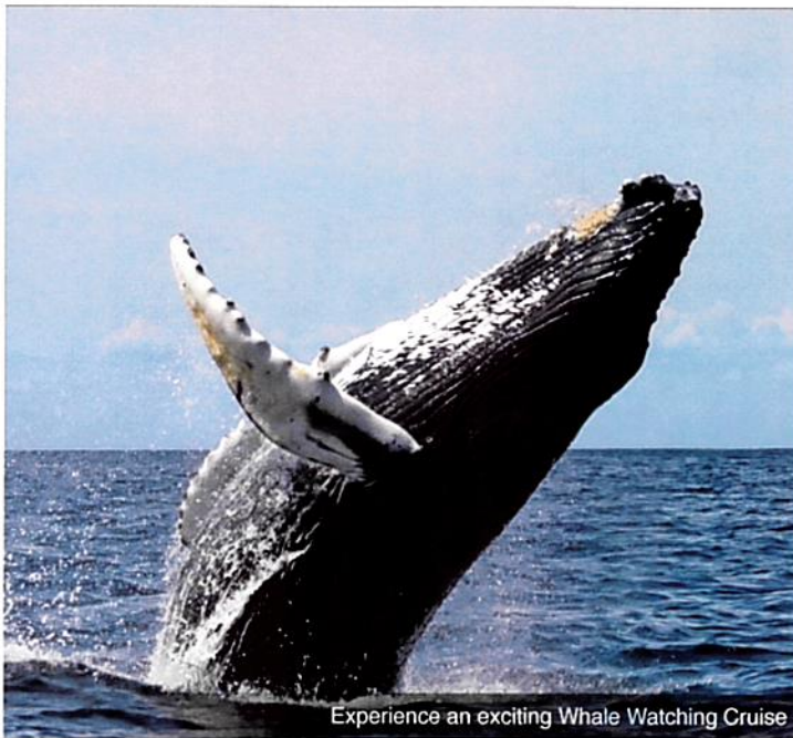
Experience an exciting Whale Watching Cruise