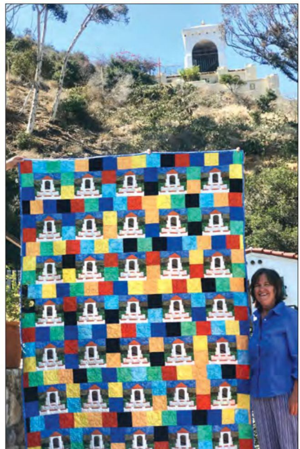
This Catalina Chimes Tower-themed quilt will be raffled off on Dec. 11 to raise money to help restore the iconic Catalina landmark.