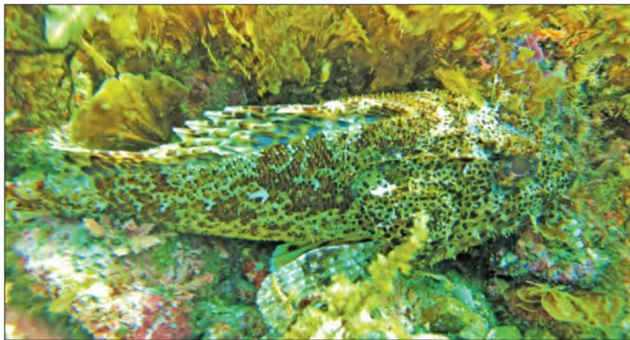
IMAGE CAPTION-A "California Scorpionfish" Becomes part of the reef. Location: Hamilton Cove, Catalina Island, California.