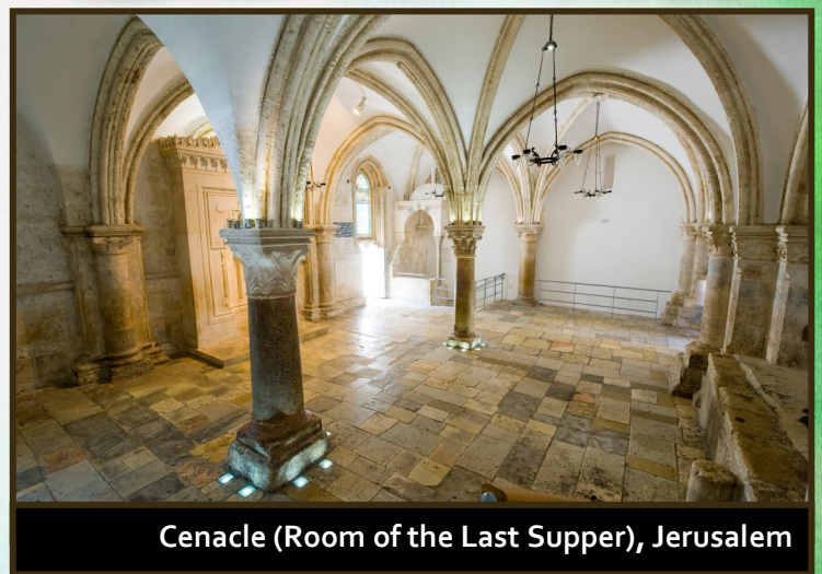
Cenacle (Room of the Last Supper), Jerusalem

This meal, this new Passover, the Eucharist or Holy Communion, would be a perpetual reminder of God's love, His grace, and the sacrifice of His Son. It would be the meal by which we as Christians would remember our story—and it will reshape our lives.