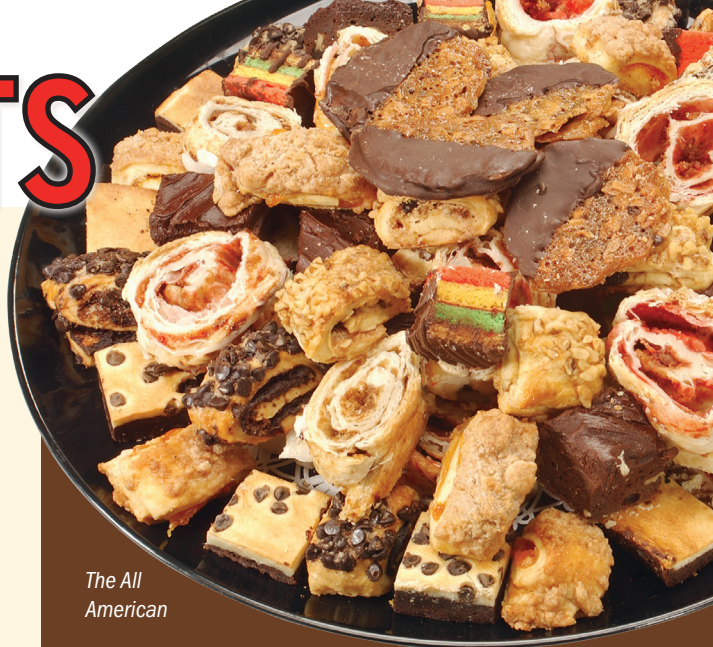
The All American