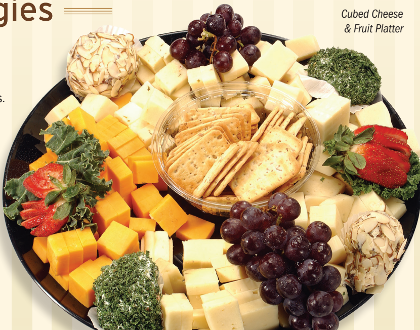
Cubed Cheese & Fruit Platter

Sliced pineapple, grapes, strawberries, cubed provolone, cheddar and Swiss cheeses. Served with assorted crackers.