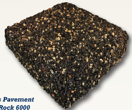
Pervious Pavement Rubber Rock 6000