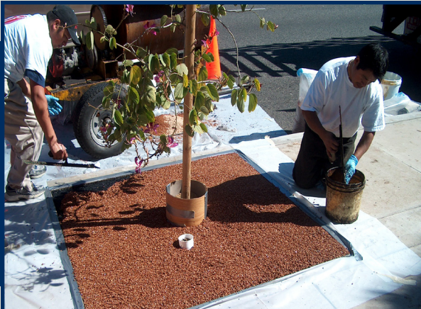
SUSTAINABLE & ECO-EFFICIENT

Rubberway Pervious Pavement systems are constructed of a recycled crumb rubber granulate that is pigmented in seven color options, and when combined with a high quality polymer, creates a flexible, open grid surface, allowing for rapid drainage.