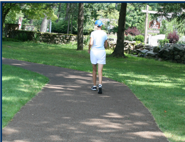
FLEXIBLE & ERGONOMICAL