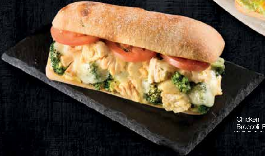
Chicken Broccoli Rustic