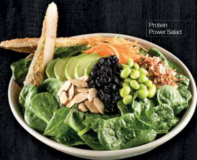
Protein Power Salad

Fresh salad mix, sliced avocado , walnuts, Mandarin oranges, seedless grapes, cranberries, apples, and gorgonzola cheese with Balsamic dressing.