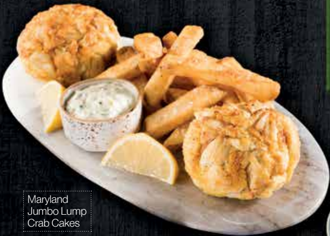
Maryland Jumbo Lump Crab Cakes

Shrimp, sausage, onions and sweet peppers sautéed in a spicy red sauce over penne pasta.