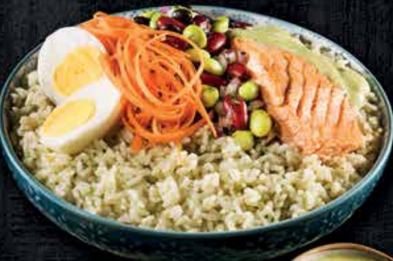
Select Salmon Bowl