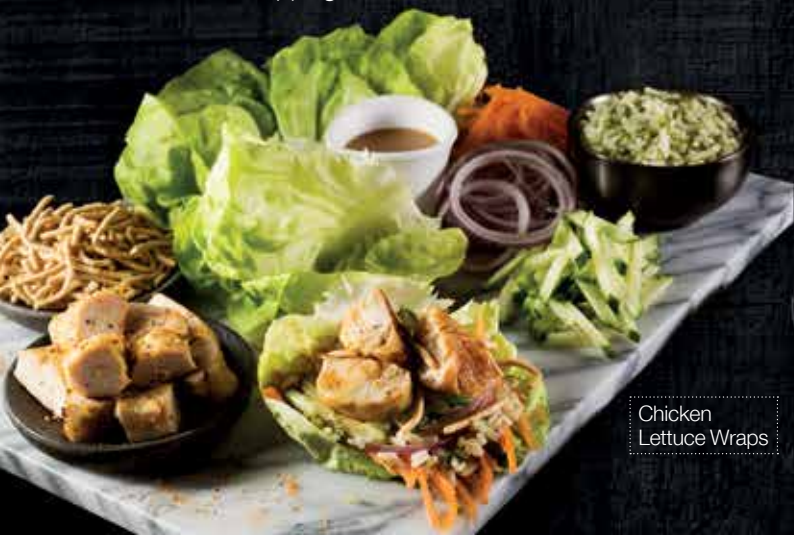
Chicken Lettuce Wraps

Onion Rings 5.49 Coated in breading and golden fried. Served with ranch dipping sauce.