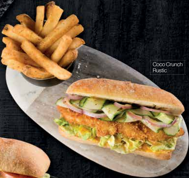
Coco Crunch Rustic