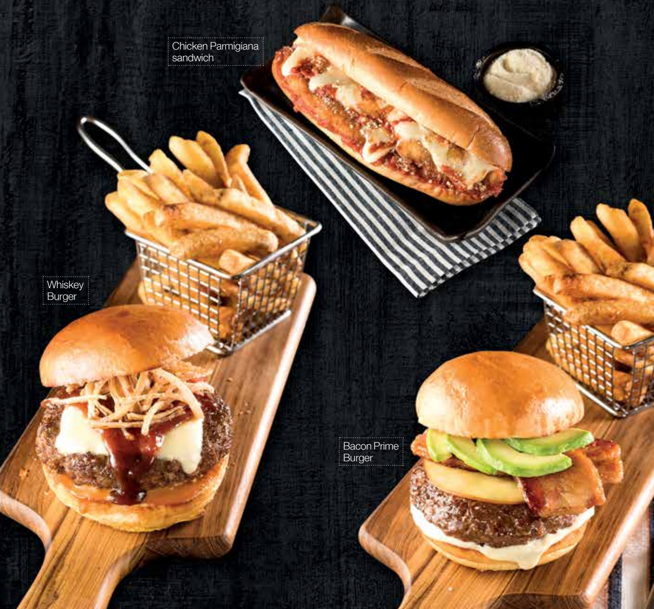
Chicken Parmigiana sandwich