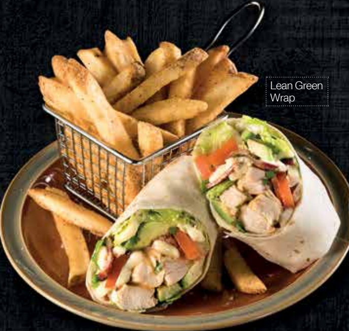
Lean Green Wrap

A mix of buffalo hot sauce and ranch dressing surround breaded chicken tenderloin , romaine lettuce, red onions, bacon, and tomato.