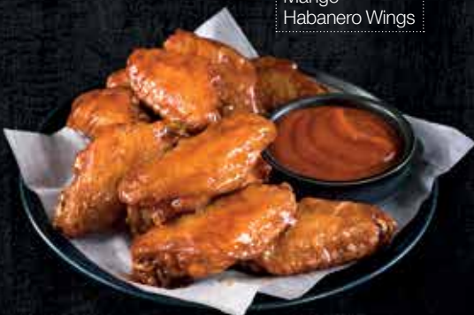
Mango Habanero Wings