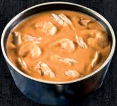
Shrimp & Crab Bisque