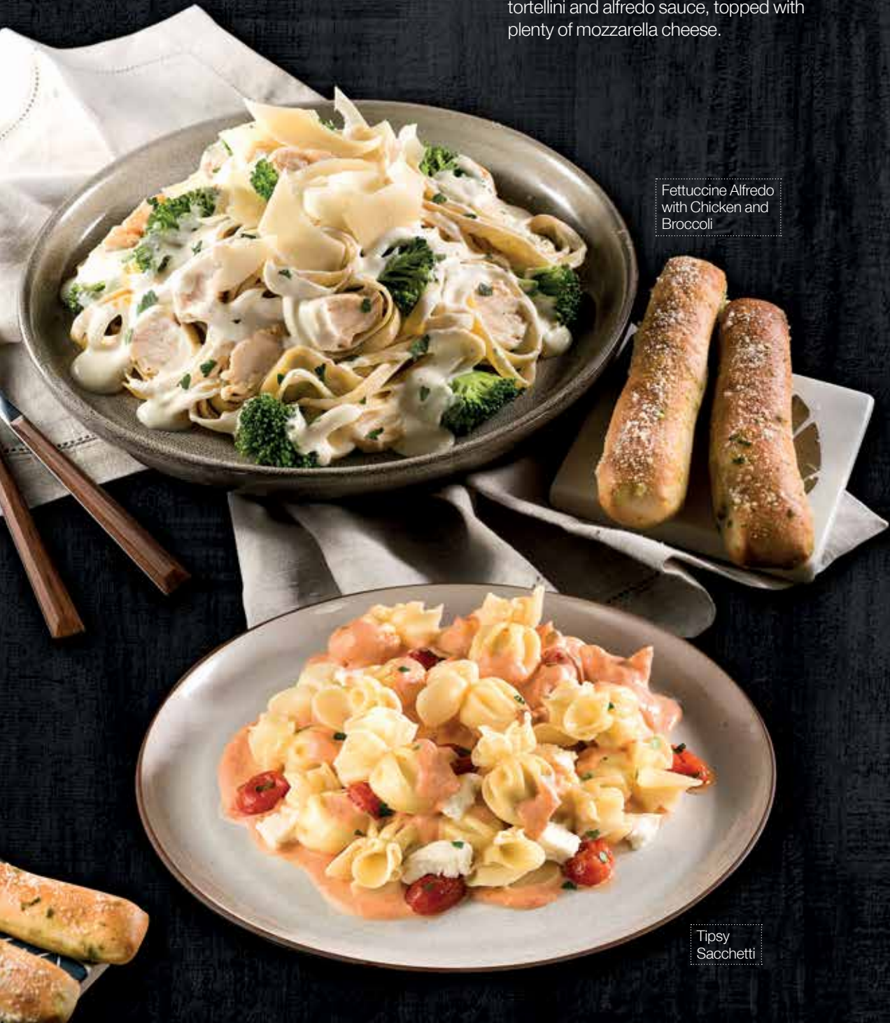
Fettuccine Alfredo with Chicken and Broccoli

A creamy delight featuring tender tortellini and alfredo sauce, topped with plenty of mozzarella cheese.