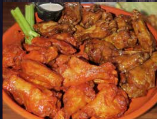
30 Wings Appetizer

TEA (SWEET OR UN-SWEET), COKE, DIET COKE, COKE ZERO, SPRITE, DIET SPRITE DR. PEPPER, DIET DR. PEPPER, PINK LEMONADE, ROOT BEER