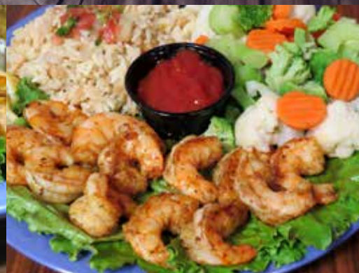
Blackened Grilled Shrimp Dinner