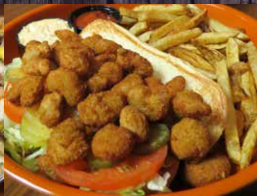
Popcorn Shrimp Po' Boy