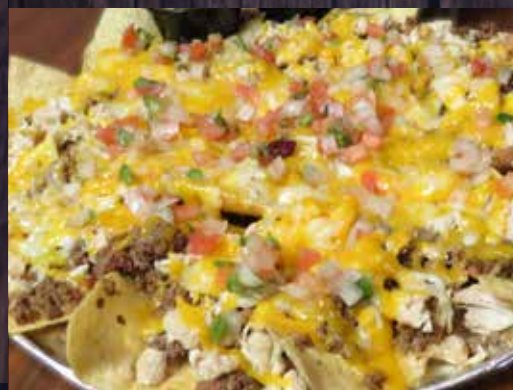
Combo Nachos topped with Pico de Gallo