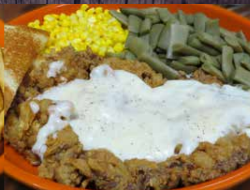
Chicken Fried Steak Dinner

**Before placing your order please inform your server if a person in your party has a food allergy. Consuming raw or undercooked meats, seafood or shellfish may increase risk of food born illness, especially if you have certain medical conditions.**