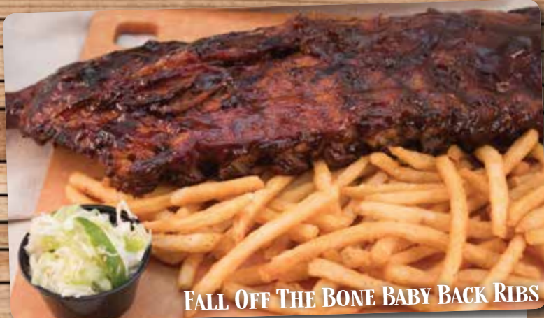
FALL OFF THE BONE BABY BACK RIBS