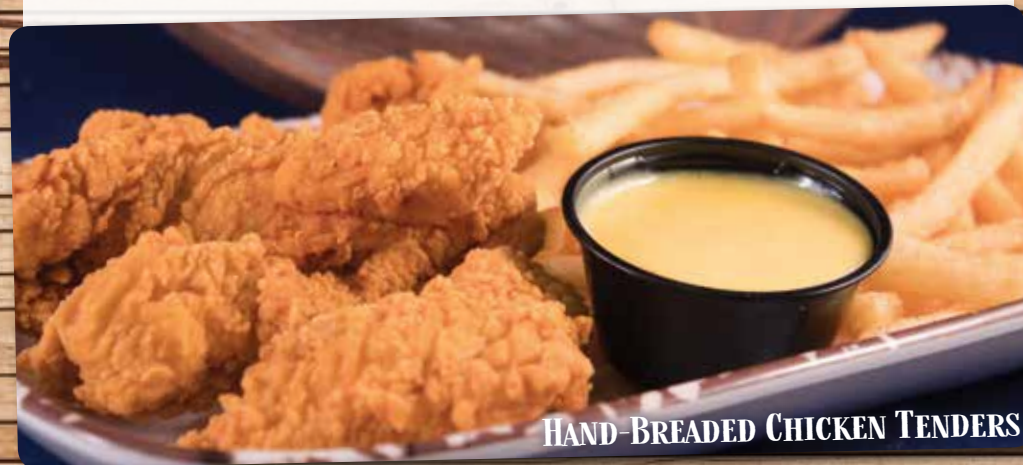
HAND-BREADED CHICKEN TENDERS

Hand-breaded chicken tenders served with honey mustard sauce and seasoned fries. 7.29