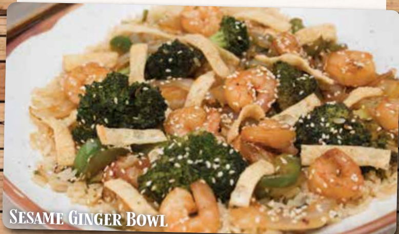
SESAME GINGER BOWL

Chicken 9.99 | Beef* 10.99 | Shrimp 11.99