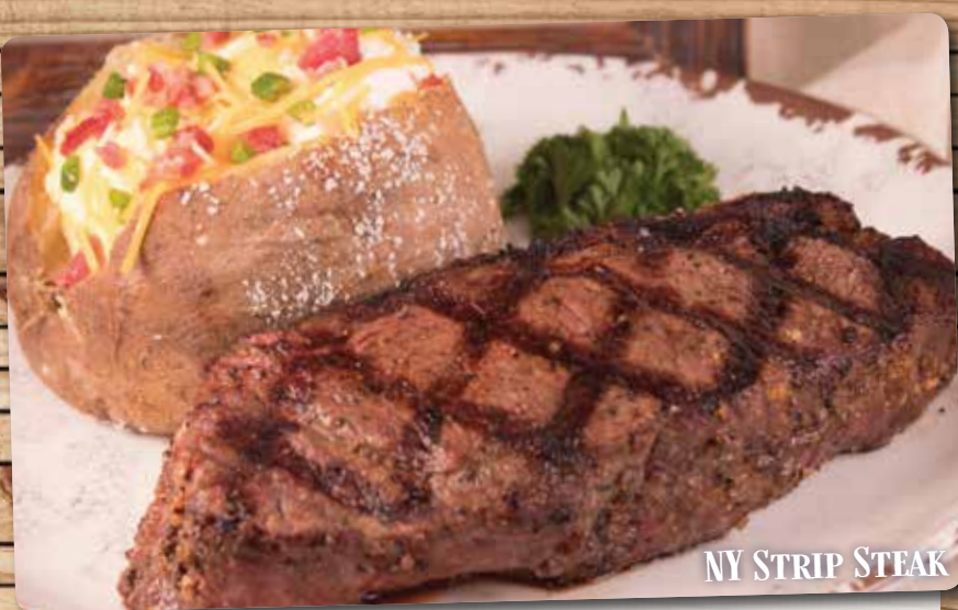
NY STRIP STEAK