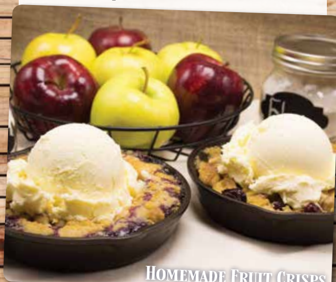
HOMEMADE FRUIT CRISPS

Made from scratch Apple Craisin, crafted with Musselman's apples, or Blackberry Crisp, served warm and topped with a scoop of vanilla ice cream. 4.99