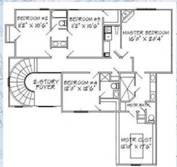
Main Level – approx. 1430 sq. ft.