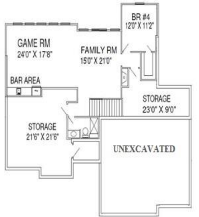
Basement – approx. 972 sq. ft.