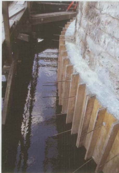
Though not the general contractor, Walker Diving was 100% self-supported

Additionally, Walker Diving completed the removal and replacement with composite timber of over 1000 lineal feet of deteriorated timber on the bridge fender system.