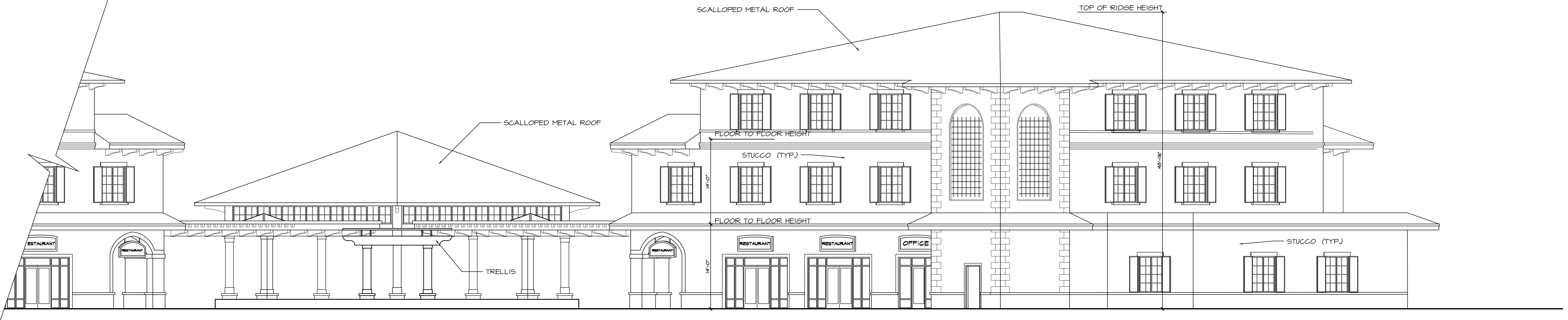
2 BUILDING B SOUTH ELEVATION A2.4B SCALE: 1/8" = 1'-0"