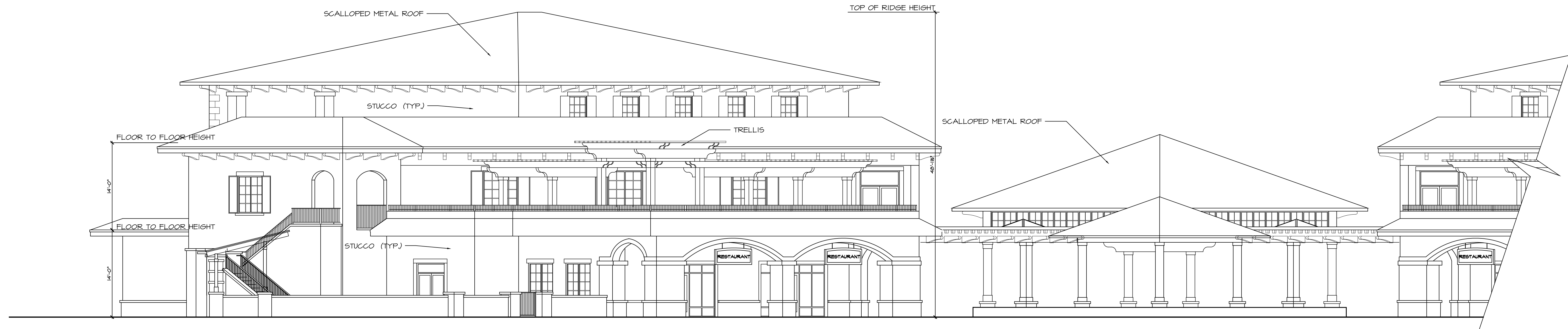
1 BUILDING B NORTH ELEVATION A2.4B SCALE: 1/8" = 1'-0"