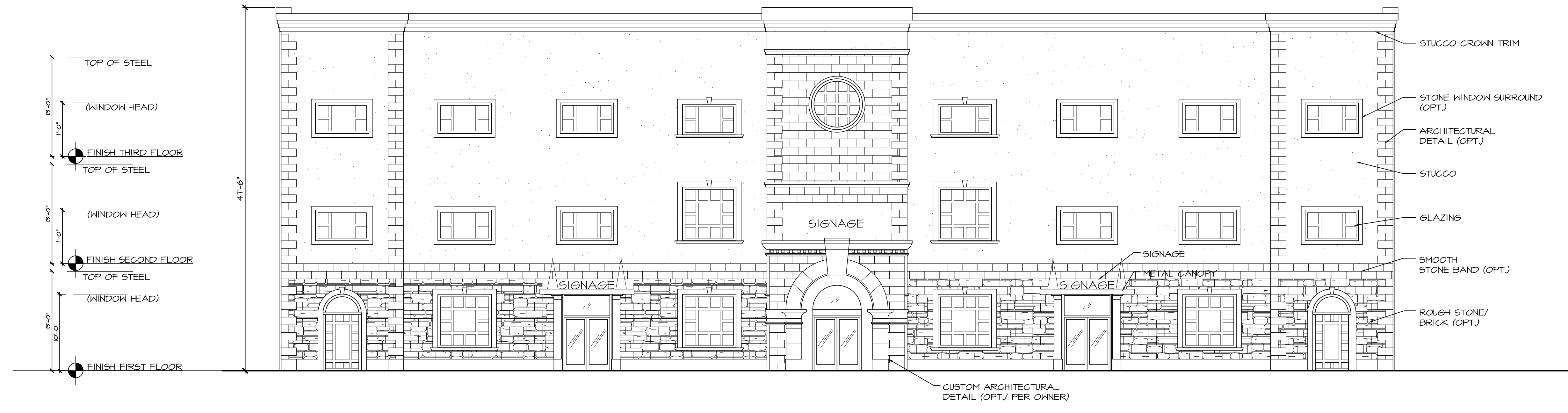
1 SOUTH ELEVATION A4.4D SCALE: 1/8" = 1'-0"