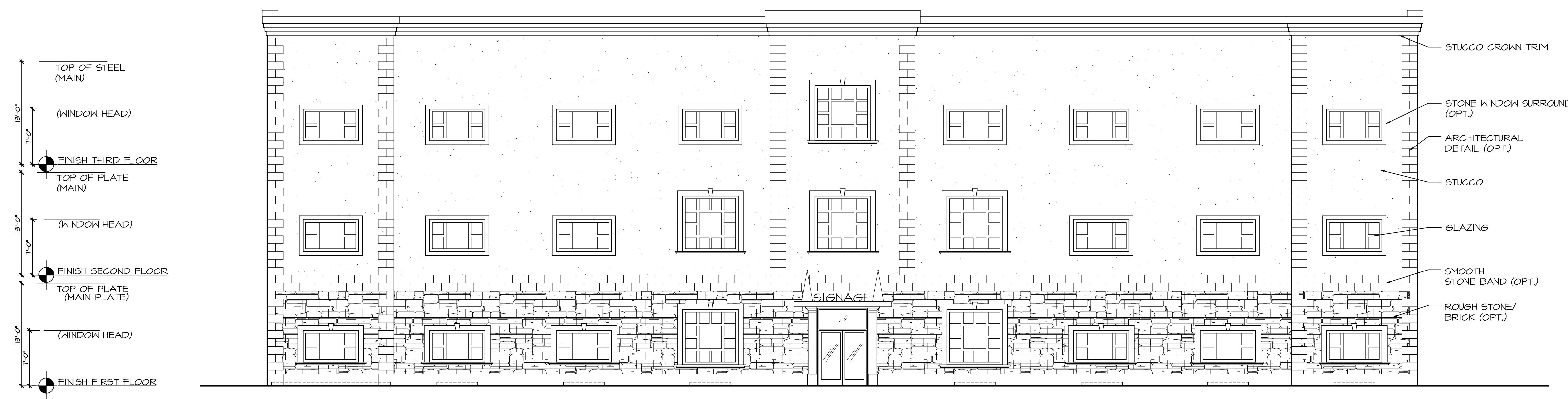
4 NORTH ELEVATION A4.4D SCALE: 1/8" = 1'-0"