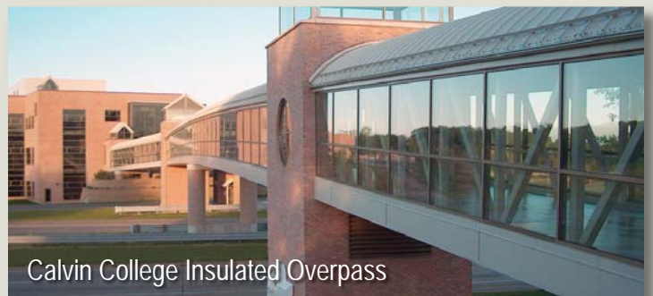
Calvin College Insulated Overpass