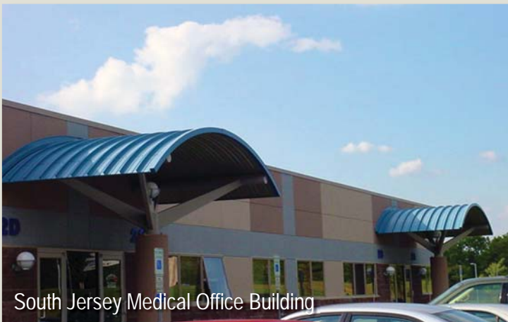
South Jersey Medical Office Building

Climate Controlled Passageways - Inquire about our insulated canopies; a unique "double wall" design providing the roof insulation and ceiling in a composite assembly.