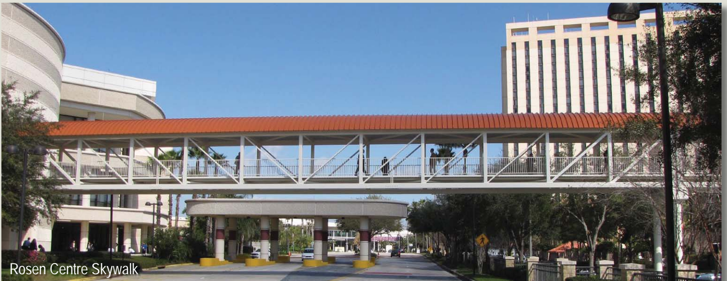
Rosen Centre Skywalk