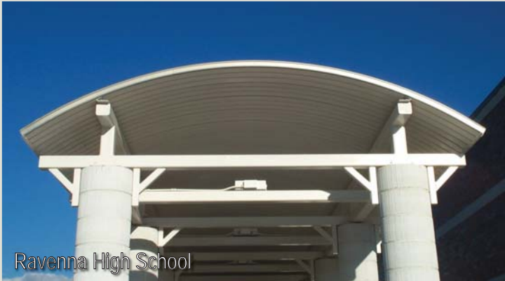
Ravenna High School

Building on the strength achieved with .050 aluminum curved ZIP-RIB roof panels, it is possible to either greatly reduce or eliminate the need for curved rafters and/or purlins in certain canopy applications. Free-Span canopies can be safely designed to spans of 16 feet without intermediate purlins. Available in 12" or 16" wide panels. Contact M&E for your specific design requirements.