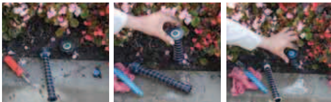
Easily retrofits to Rain Bird 1800 Series

Why pay for a body you're just going to throw away? I-PRO offers a 4", 6" and 12" replacement spray head that is everything but the body! Ideal for maintenance, this spray head also fits right in the can of the Rain Bird® 1800® Series for an easy retrofit. And a great up grade option with features that are contractor-driven and field-proven, the I-PRO Series is sure to save you time and money.