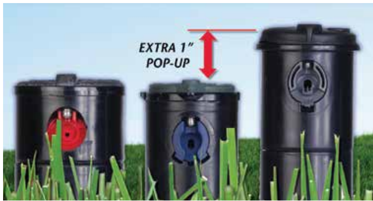
The T5 Series delivers an extra inch of pop-up.