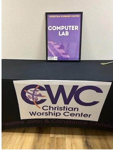
New computer lab at CWC of the Leesburg community.