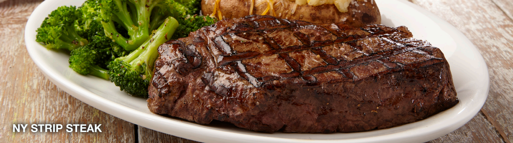
NY STRIP STEAK