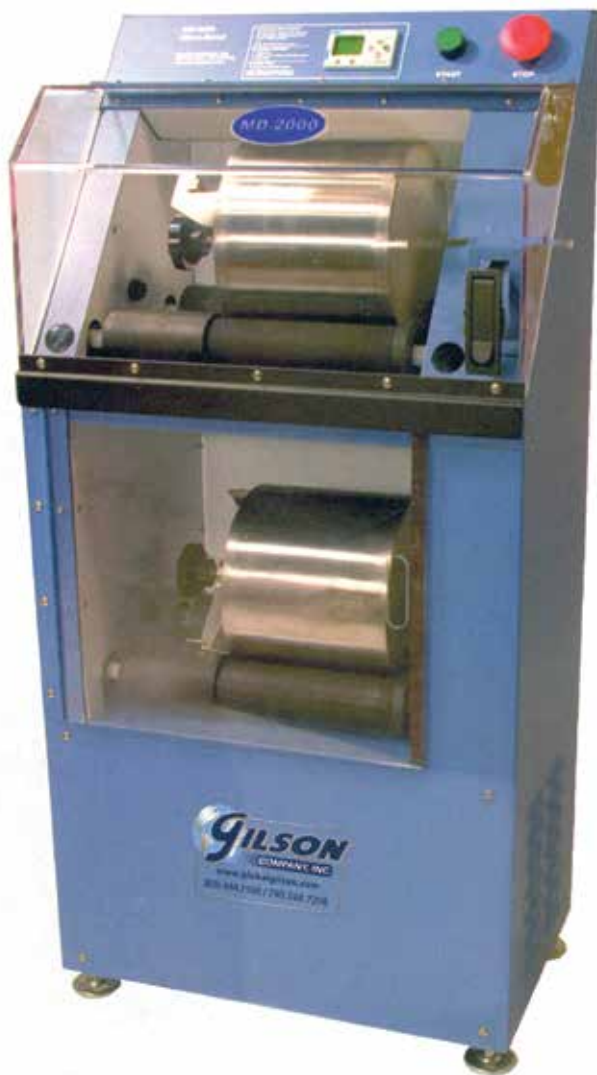
Figure 1. The Micro-Deval test apparatus.

The Micro-Deval test is evolving as the test method of choice for evaluating durability of aggregates in North America. Defined by CSA A23.2-23A, The Resistance of Fine Aggregate to Degradation by Abrasion in the Micro-Deval Apparatus (CSA 2004) and ASTM D 7428-08 Standard Test Method for Resistance of Fine Aggregate to Degradation by Abrasion in the Micro-Deval Apparatus , the test method involves subjecting aggregates to abrasive action from steel balls in a laboratory rolling jar mill. In the CSA test method a 1.1 lb (500 g) representative sample is obtained after washing to remove the No. 200 (0.080 mm) material. The sample is saturated for 24 hours and placed in the Micro-Deval stainless steel jar with 2.75 lb (1250 g) of steel balls and 750 mL of tap water (See Figure 1). The jar is rotated at 100 rotations per minute for 15 minutes. The sand is separated from the steel balls over a sieve and the sample of sand is then washed over an 80 micron (No. 200) sieve. The material retained on the 80 micron