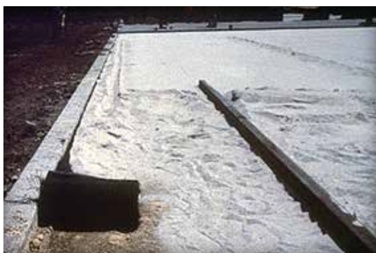
Figure 7. Woven geotextile used to contain bedding sand from migrating laterally. Visit www.icpi.org for detail drawings.

Interlocking concrete pavements should also be designed and constructed such that the bedding sand should not be able to migrate into the base, or laterally through the edge restraints. Dense-graded base aggregates with 5% to 12% fines (the amount passing the No. 200 or 0.075 mm sieve), will ensure that the bedding sand does not migrate down into the base surface. For pavements built over asphalt or con-