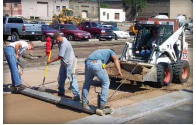
Figure 5. Mechanical screeding is the most efficient method of bedding sand installation

Role of Bedding Sand in Construction —Provided that the base was installed according to recommended construction practices and tolerances (See ICPI Tech Spec 2—Construction of Interlocking Concrete Pavements ), the bedding sand ensures that the pavers have a uniform slope and meet surface tolerances without surface undulations or “waviness.” Sand should be loosely screeded to a uniform thickness of 1 in. (25 mm) to 1½ in. (38 mm), which will compact to a thickness of ¾ in (19 mm) to 1¼ in (31 mm). for vehicular applications. Screeds can either be pulled by hand or by machine (mechanical screed) as shown in Figures 4 and 5. Mechanical screeding provides the most efficient method. Pavers are placed on the loose uncompacted sand. Contractors should select sand that allows the pavers to be uniformly seated during their initial compaction with a minimum 5000 lb (22kN) force plate compactor.