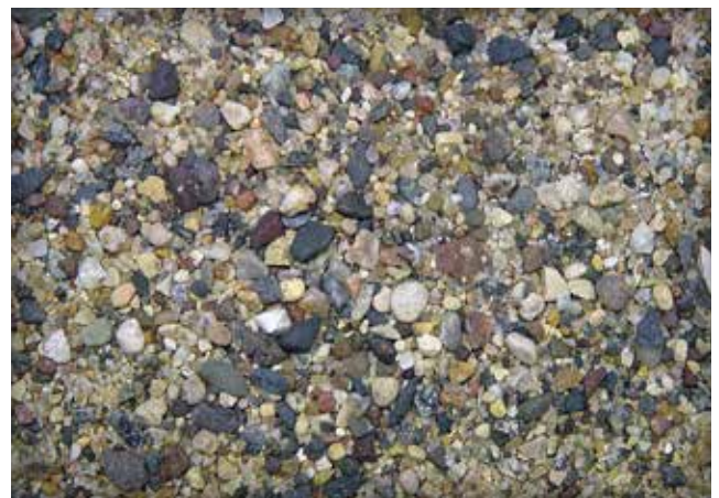
Figure 3. Example of sand from the ICPI bedding sand test program with a total combined percentage of sub-angular and sub-rounded particles equal to 65% according to ASTM D2488

Recommended Material Properties —Table 3 lists the primary and secondary material properties that should be considered when selecting bedding sands for vehicular applications. Bedding sands may exceed the gradation requirement for the maximum amount passing the No. 200 (0.075 mm) sieve as long as the sand meets degradation and permeability recommendations in Table 3. Micro-Deval degradation testing can be replaced with sodium sulfate or magnesium soundness testing as long as this test is accompanied by the other primary material property tests listed in Table 3. Other material properties listed, such as petrography and angularity testing are at the discretion of the specifier and may offer additional insight into bedding sand performance.