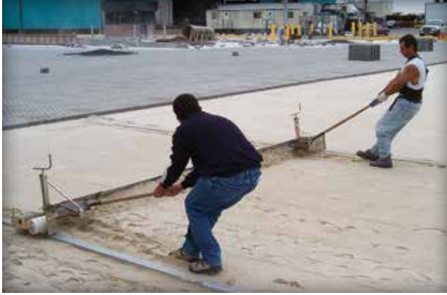
Figure 4. A two-man hand pulled screed