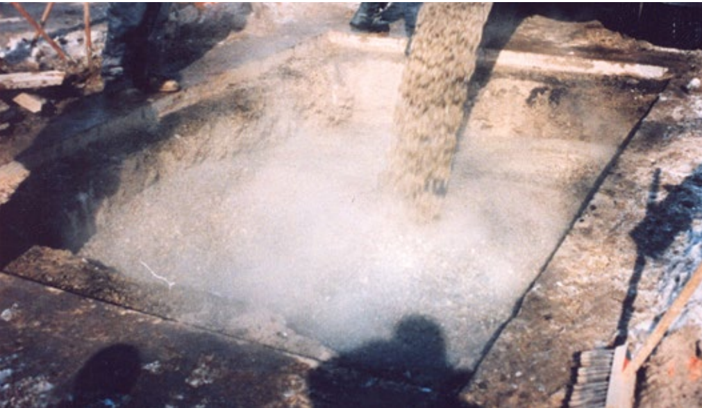
Figure 11. Low density concrete fill (unshrinkable fill) poured into a utility trench from a ready-mix concrete truck.

front end loader. Pieces along the saw cuts should be removed carefully to prevent damage to the edges.