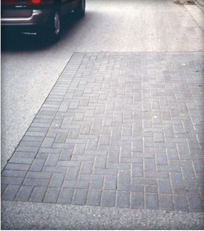
Figure 8. Utility cut repair in a residential area in London, Ontario.

require no curing. They can handle traffic immediately after reinstatement, reducing user delays. Furthermore, reinstated concrete pavers preserve the aesthetics of the street or sidewalk surface. There are no patches to detract from the character of the neighborhood, business district, or center city area. With many projects, concrete pavers help define the character of these areas. Character influences property values and taxes. Attractive paver streets and walks without ugly patches can positively affect this character.