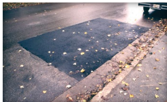
Figure 7. Pavement damage from settlement and shrinkage of cold patch asphalt.

Reducing User Costs —User costs due to traffic interruptions and delays are reduced because concrete pavers