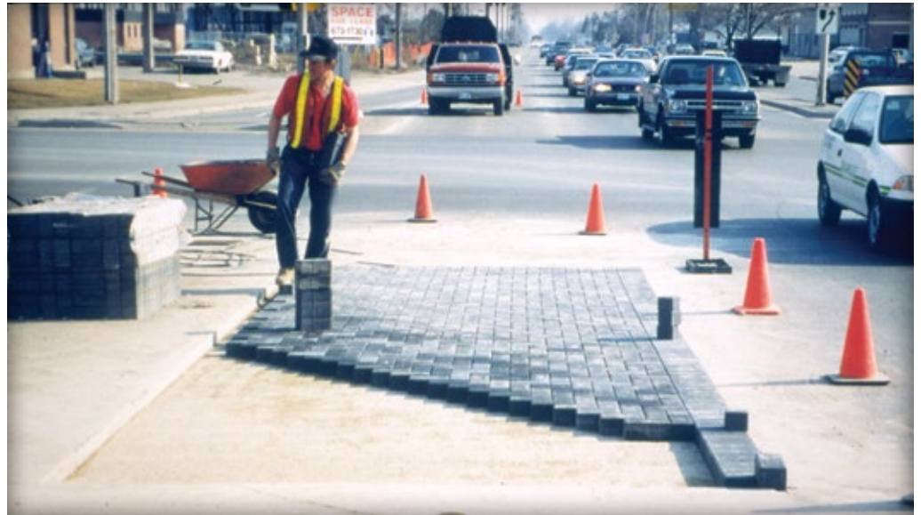
Figure 12. Pavers are laid in a 90 degree herringbone pattern between the border courses.

ers [nominally 4 in. by 8 in. (100 mm x 200 mm)] should be placed against the cut asphalt sides as a border course. They should be placed in a sailor course, i.e., the long side against the asphalt. No cut paver should be smaller than one third of a unit. Place pavers between the border course in a 90 degree herringbone pattern (Figure 12). Joints between pavers should be between \frac{1}{16} and \frac{5}{16} in. (2 to 5 mm). Compact the pavers with a minimum 5,000 lbf (22 kN) plate compactor. Make at least four passes with the plate compactor. A small test area of pavers may need to be compacted to check the amount of settlement. The bedding sand thickness should