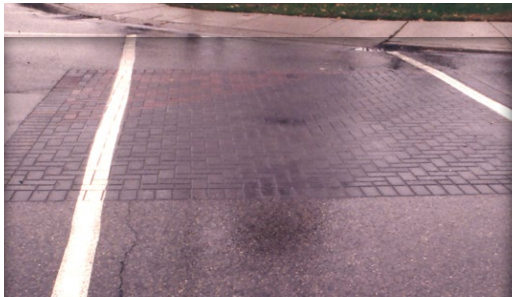
Figure 13. Concrete pavers in utility cuts can be painted as any other pavement.