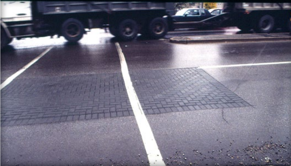
Figure 10. A patch of pavers in a heavily trafficked intersection in London, Ontario