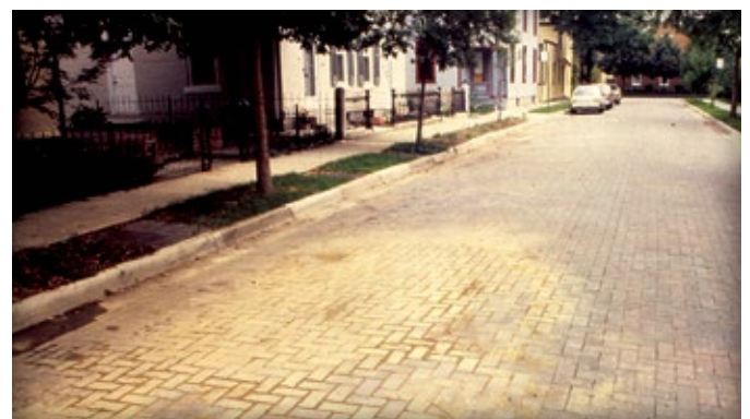
Figure 5. The final paver surface is continuous. There are no cuts or damage to the pavement.