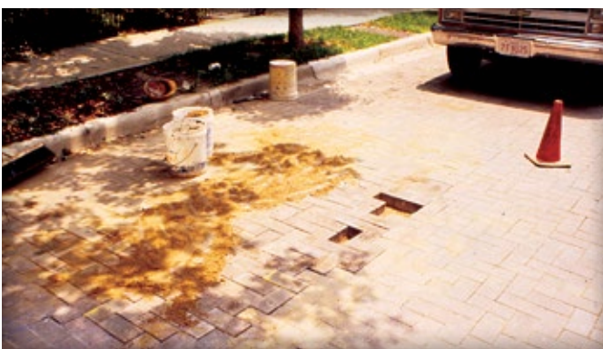
Figure 4. Reinstatement of the pavers, bedding and joint sand