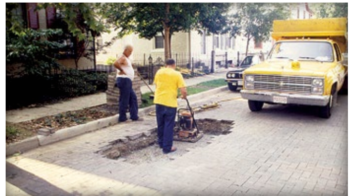
Figure 3. Compaction of the base