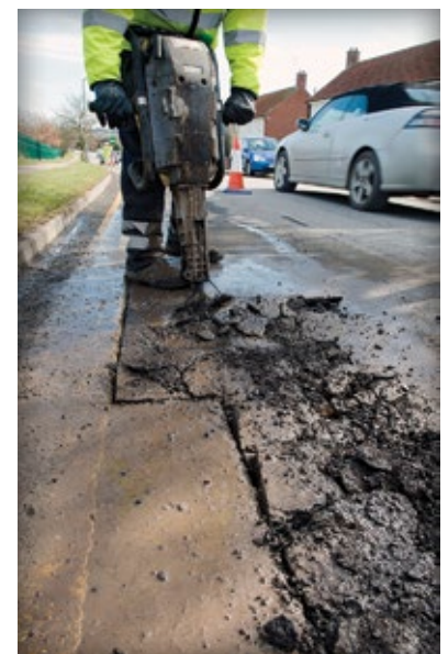
Figure 1. Repairs to utilities are a common sight in cities, incurring costs to cities and taxpayers.

Several studies have demonstrated a relationship between utility cuts and pavement damage. For example, streets in San Francisco, California, typically last 26 years prior to resurfacing. A study by the City of San Francisco Department of Public Works demonstrated that asphalt streets with three to nine utility cuts were expected to require resurfacing every 18 years (1). This represented a 30% reduction in service life