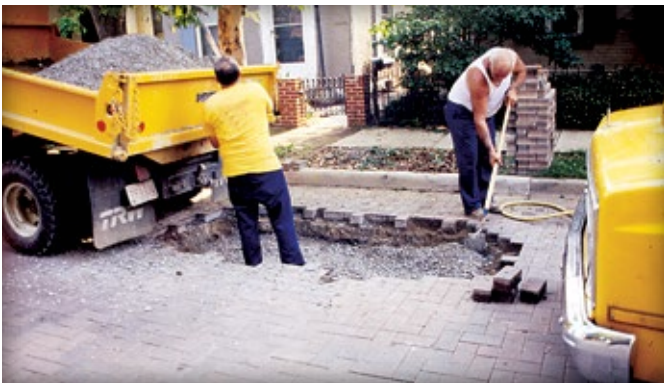
Figure 2. Removal of concrete pavers for a gas line repair in Dayton, Ohio.

to 60% (2). Research in Santa Monica, California, showed that streets with utility cuts saw an average decrease in life by a factor of 2.75, or 64% (3). A 1994 study by the City of Kansas City, Missouri, notes that "street cuts, no matter how well they are restored, weaken the pavement and shorten the life of the street." It further stated that permit fee revenue does not