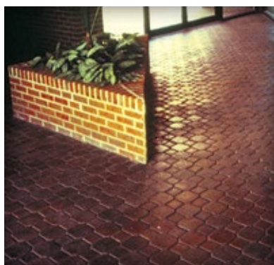
Figure 1. Many sealers enhance the appearance of concrete pavers and protect against staining.

Commercial stain removers available specifically for concrete pavers provide a high degree of certainty in removing stains. Many kinds of stains can be removed while minimizing the risk of discoloring or damaging the pavers. The container label often provides