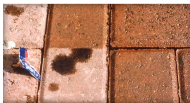
Figure 9. Sealers resist stains which makes them ideal for high use areas where they might occur.