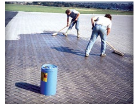
Figure 10. Urethane is applied with squeegees to stabilize joint sand between pavers on aircraft pavement.

For other applications, follow the sealer manufacturer's recommendation for application and for the protective gear to be worn during the job. With some sealers that recommend two coats, the first coat