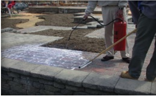
Figure 3. This liquid joint sand stabilizer is applied with a low-pressure sprayer and squeegeed across the surface after allowing some time for soaking into the joints. This helps maintain slip and skid resistance of the paver surface.