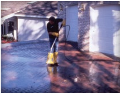
Figure 2. Pressurized cleaning equipment used by professional cleaning and sealing companies can bring out the best appearance from pavers.

supplier or chemical company supplying the chemicals for recommendations on proper dilution and application of chemicals for removal of efflorescence. They are generally applied in sections beginning at the top of slope of the pavement. If the area is large, a sprayer is an efficient means to apply the cleaner. The