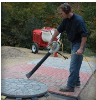
Figure 6. Whether using liquid or dry joint stabilization materials, the surface of the pavers should be cleaned with a blower or broom after the joint sand is compacted into the joints.

Prior to applying liquid materials, the surface should be clean and dry and any efflorescence removed from the pavers. Either a broom or leaf blower can efficiently remove excess sand.