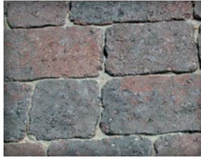
Figure 4. Liquid joint sand stabilizers can deepen the surface color slightly and they provide some surface sealing as well. Tumbled pavers shown here have wider joints than other shapes. These type of pavers can require stabilization of the joint sand.