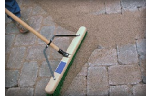
Figure 5. Joint sand can be pre-mixed and delivered to the site (typically in bags), or mixed with stabilizer at the site, then swept into the joints, compacted for consolidation in them to create interlock, and wetted to activate the stabilizer.

sand particles. The rate of stabilization depends on the amount and sources of traffic, plus sources of fines that work their way into the joints from traffic over time.