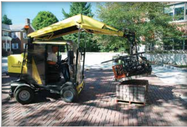
Figure 1. Mechanical installation of interlocking concrete pavements (left) and permeable units (right) is seeing increased use in industrial, port, and commercial paving projects to increase efficiency and safety.