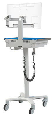
... or charge from the cart.

...perfect for infection control applications! >>