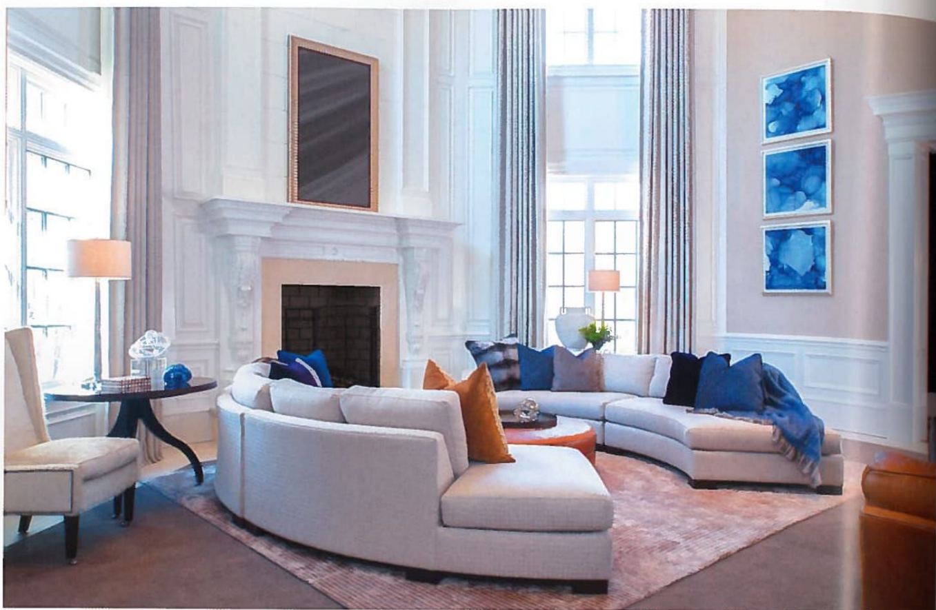
A formal family room (above) features stunning, two-story draperies and a pair of sweeping, curved sofas. A deep-hued, upholstered wall provides a rich backdrop to eclectic furnishings in a master bedroom (opposite). Critzos and her team combined dramatic contemporary pieces within the architectural context of a classic dining room (right).