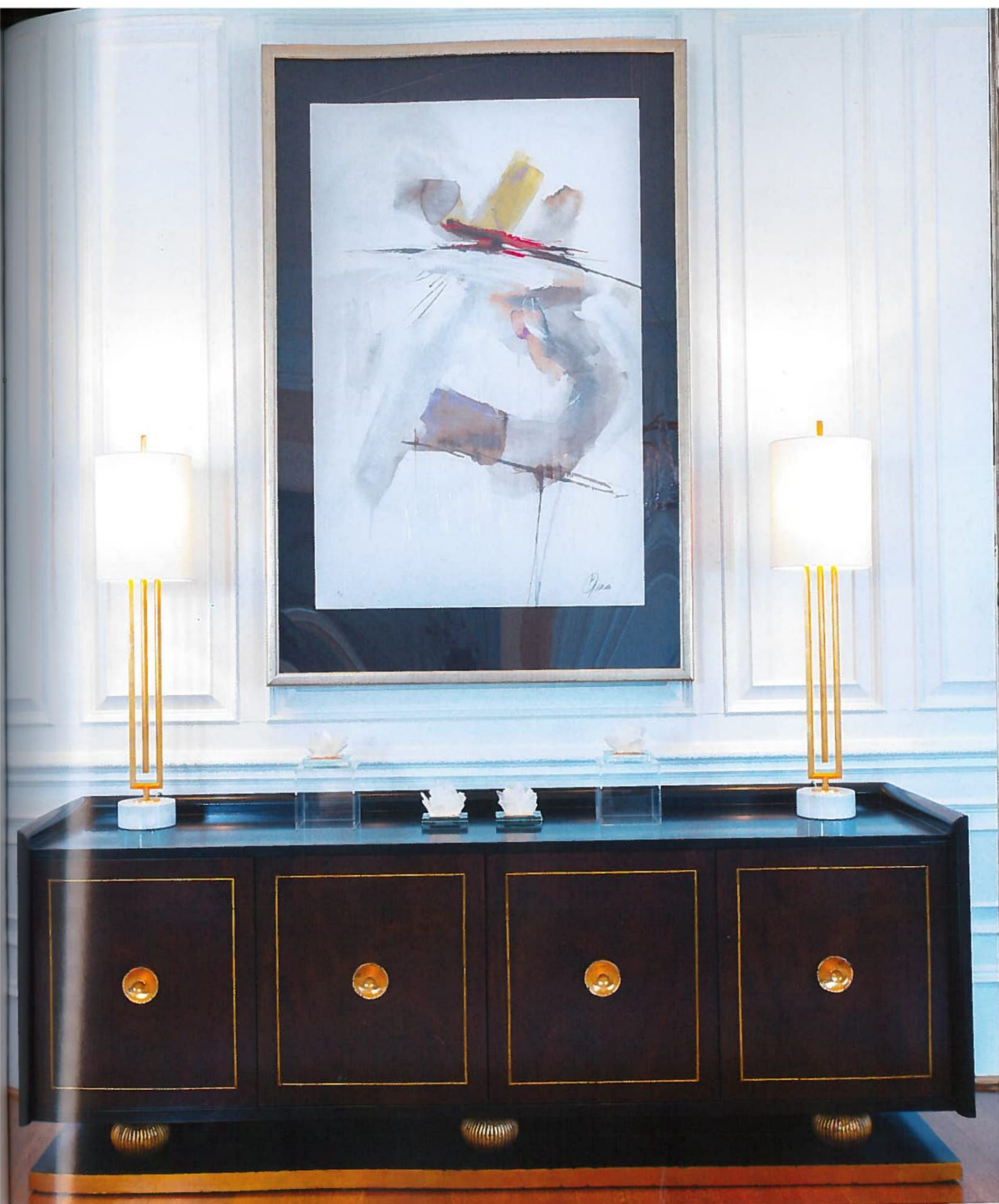
Colorful dining chairs in a modern silhouette convey whimsy in a breakfast room (opposite, top). Clean-lined furnishings and modern art lend a fresh approach to a dining room with classical paneling (above). A sleek custom cabinet with interior lighting defines and divides two areas in a master suite (opposite, bottom).