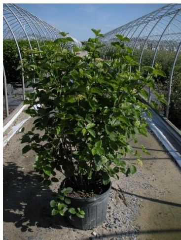
VIBURNUM DENTATUM CHICAGO LUSTRE Glossy dark green foliage turning reddish- purple in the fall. Grows to 10' x 10'. Mature height: 10 feet Mature spread: 10 feet Zones: 3-9 Grown in: #5 Pots