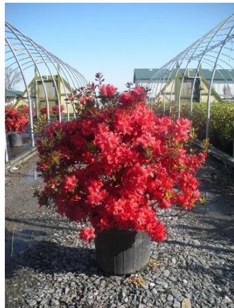
AZALEA STEWARTSONIAN Orange-red Gable hybrid of extreme hardiness. Early. Tough. Vigorous. Mature height: 5-6 feet Mature spread: 4-5 feet Zones: 5-8 Grown in: #3 pot