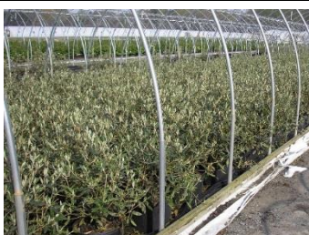
VIBURNUM PRAGENENSE Attractive semi- evergreen shrub that grows to 7-8' x 6-7'. Very

nice lustrous foliage with heavy tomentose on underside. Creamy white blooms in May. Mature height: 8 feet Mature spread: 7 feet Zones: 5-8 Grown in: #5 Pots