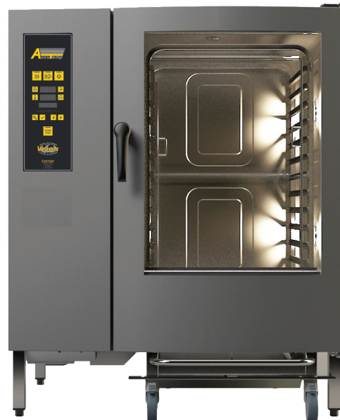
V1221IE Model shown