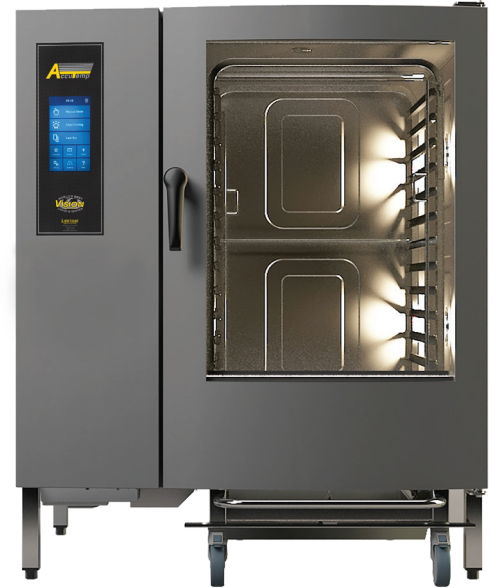
T1221IE Model shown

Combi Steam oven shall be AccuTemp model T1221IE Vision Touch Series with Advanced Steam Injection System with built in heat exchanger. Constructed of heavy duty #304 stainless steel with heavy duty 2” insulation and triple-pane tempered curved glass door, right hinged standard. Operation modes include: steam, hot air, combination, and proofing with Golden Touch finishing feature. Vision Touch include MyVision customizable control panel, Active Humidity Control with 0-100% humidity levels, Automatic Capacity Manager, 7 speed auto-reversing fan, Flap Valve, multi point probe, multi-rack timers, preheat and auto-cool down, automatic fan stop, and Multi-Tasking function. Automatic cleaning cycle with 5 cleaning levels and hand shower. Service Diagnostic System, for unit check-up, service, and troubleshooting, USB port, and HACCP data records. Ecologix technology for lower energy and water usage.