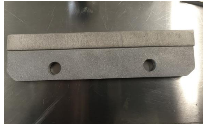
FLEXWEAR on Belt Scraper (Above)