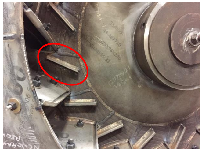
Deflector Plate on a Fan Assembly (Right)