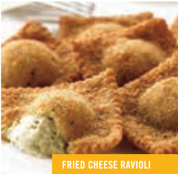
FRIED CHEESE RAVIOLI