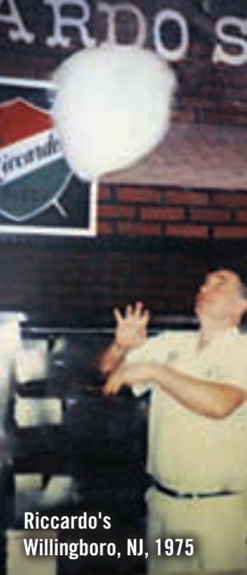
Riccardo's Willingboro, NJ, 1975

Hours: SUN THRU THU 11AM-11PM | FRI & SAT 11AM-12AM We deliver to Delran, Beverly, Delanco & Riverside ($10 min. for delivery)