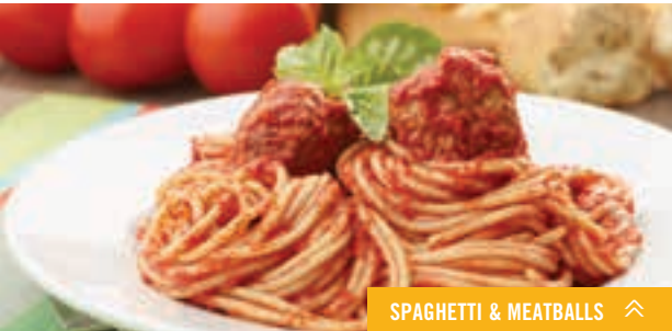
SPAGHETTI & MEATBALLS

Our food is cooked to order with the highest quality ingredients available