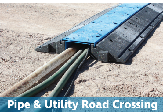
Pipe & Utility Road Crossing