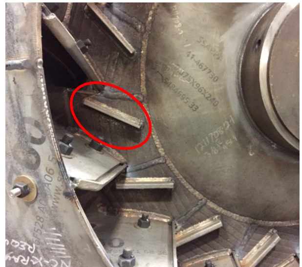
Deflector Plate on a Fan Assembly