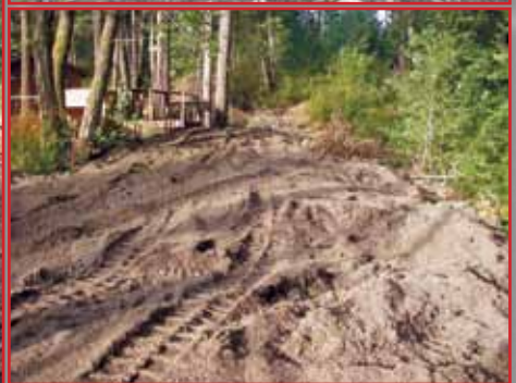
Discarded potting soil left exposed to the winter rains will leach remaining nutrients into the environment and possibly waterways.