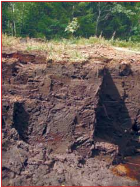
A 10-foot plus cut in the earth, a result of the peat bog mining.

Importing potting soil is very energy intensive in its production and transportation to our region. The production of potting soil depletes natural resources, such as peat moss, perlite and pumice. Plastic soil bags also create an exorbitant amount of landfill. Dumping used potting soil is illegal and can be a source of pollution to local rivers.