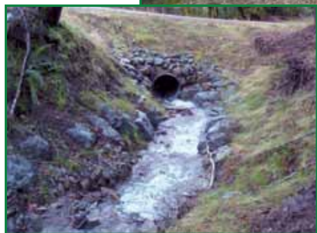
A graded area that has been mulched with straw and grass seed to prevent erosion and runoff, above. A well-maintained culvert, left.