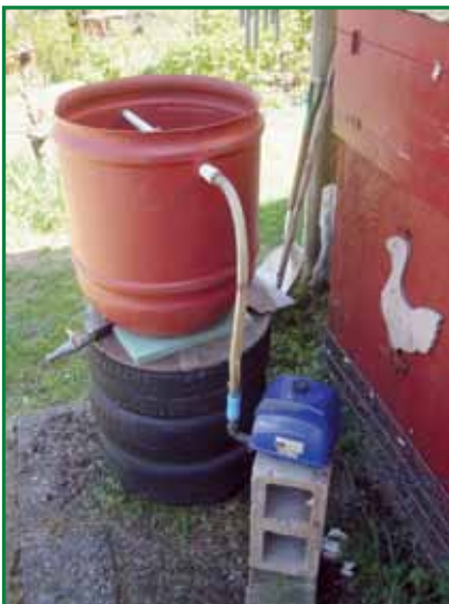
A homemade compost tea brewer

Synthetic chemical-based water soluble fertilizer can easily enter streams and waterways. Even a small amount can have serious environmental impacts.