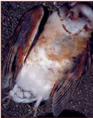
A Barn Owl killed by rodenticide.