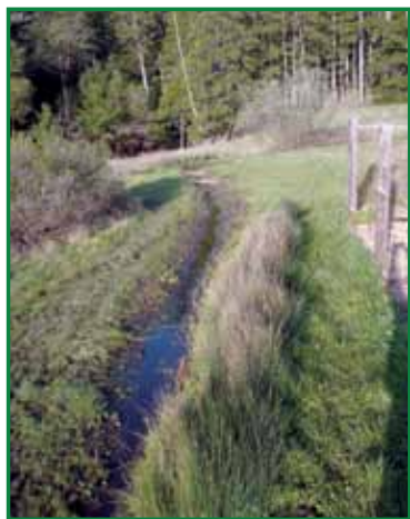
A bio-swale with a filter strip of native vegetation