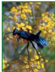
A Beneficial Insect, the Predatory Wasp, on Bronze Fennel