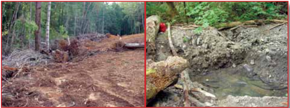
Poorly done excavation work leaves a Class II stream buried in debris, left. Instream excavation work has turned this headwaters stream into a “pond” which is immediately drained out of the stream, eliminating aquatic life, right.

Diverting and/or pumping water from springs, creeks, and rivers during the summer months reduces streamflows and increases water temperatures. This contributes to blue-green algae blooms in our rivers, affects the quality of water for human and animal consumption, and threatens the survival of endangered salmon, steelhead, and other aquatic life. Anytime you are taking water from a seasonal or year-round waterway such as a creek, stream, or river you are creating a water diversion.