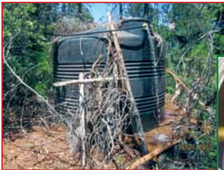
Overflowing water from a tank—a waste of diverted water.