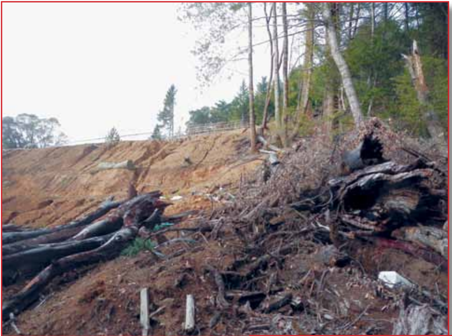
Buried stream and riparian buffer resulting from the excavated flat showing deep gullies where sediment has washed down hill in the heavy winter rains, above. A partially obstructed culvert, right.

Poorly maintained or badly constructed roads and excavation sites are a major source of sediment pollution in our watersheds. The heavy winter rains experienced by our bioregion put a tremendous amount of water onto road systems, transferring vast amounts of loose sediment into our creeks and rivers. Poorly maintained or plugged culverts can lead to catastrophic failures that can severely damage roads and nearby streams. This degrades or eliminates habitat essential to fish and other aquatic life and can cause sediment dams to occur leaving isolated pools that fish can't get to or escape from.