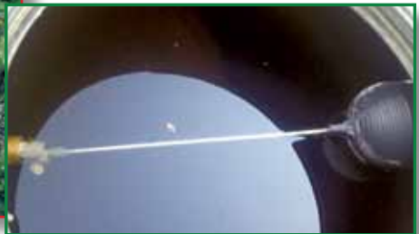
Float valves installed inside of tanks keep water from overflowing.