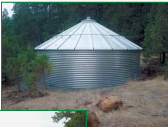
Rainwater catchment tank, above. Rooftop rainwater catchment system, left.

✓ You can avoid the use of groundwater by installing rainwater catchment systems and tanks.