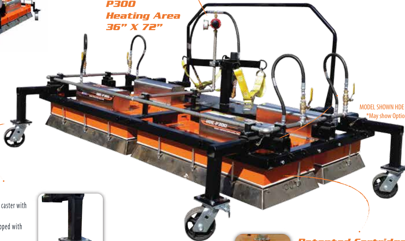
MODEL SHOWN HDE P300 *May show Options