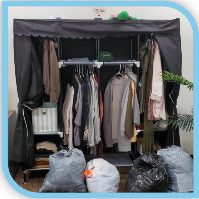
We accept Donations anytime!

Our Horizon Cares Closet accepts new and gently used clothing, shoes, handbags, jewelry, and accessories for all genders and sizes, including children's and infants' clothing.