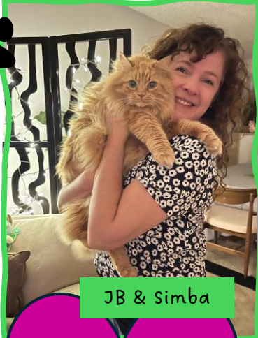
JB & Simba

Approx. 4.1 million shelter animals are adopted yearly