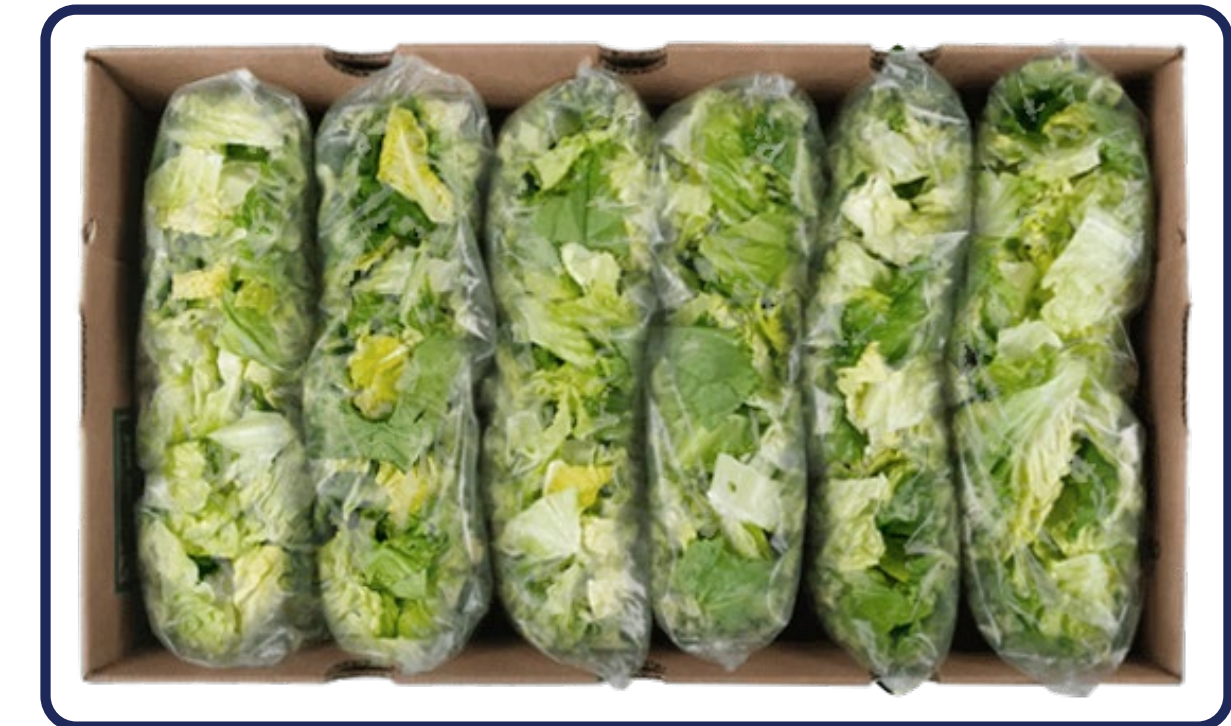
1 Carton Chopped Romaine