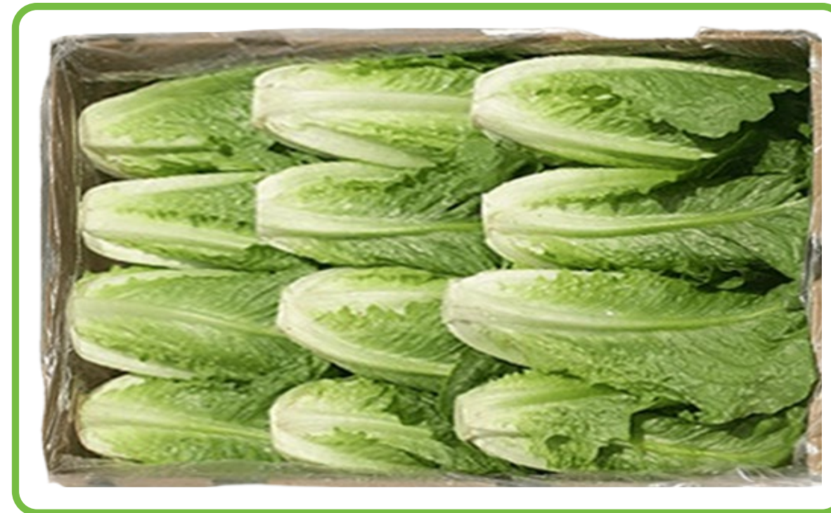
1 Carton Romaine Lettuce