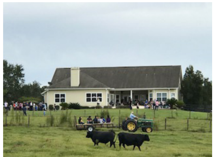
Hosted International Ministry Party