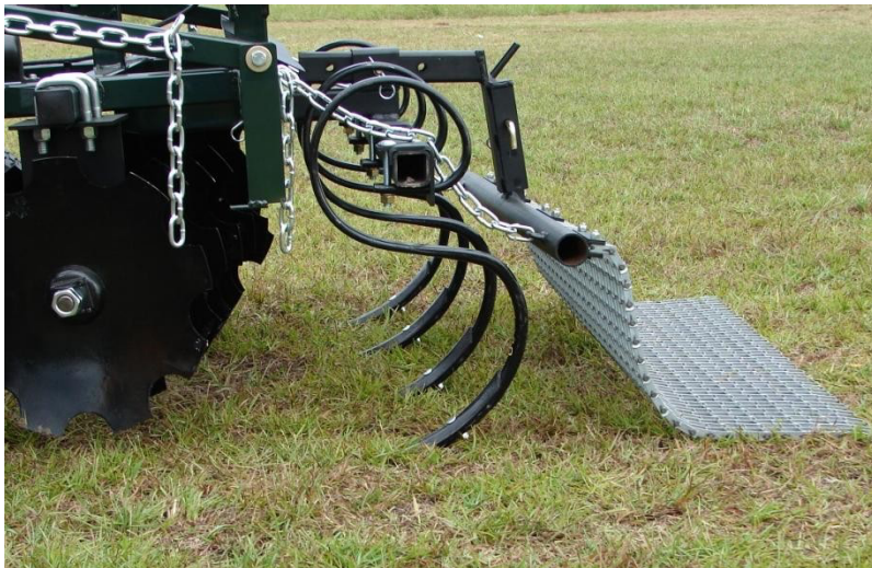
Metal Drag used in Tandem with Chisel Plow Attachment

These extra sharp spikes/chisel points penetrate the soil with ease and increase the down pressure forcing the discs deeper into your soils for increased tillage.