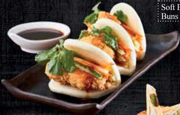
Soft Bao Buns

Shell pasta in aged white cheddar topped with a crunchy parmesan crumble