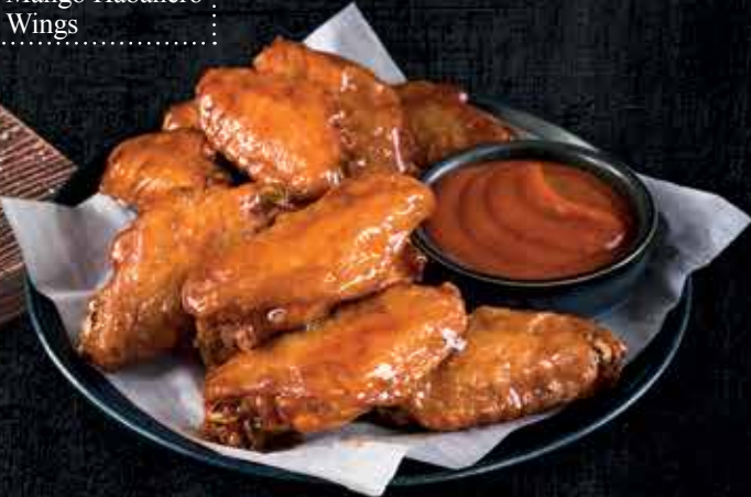
Mango Habanero Wings