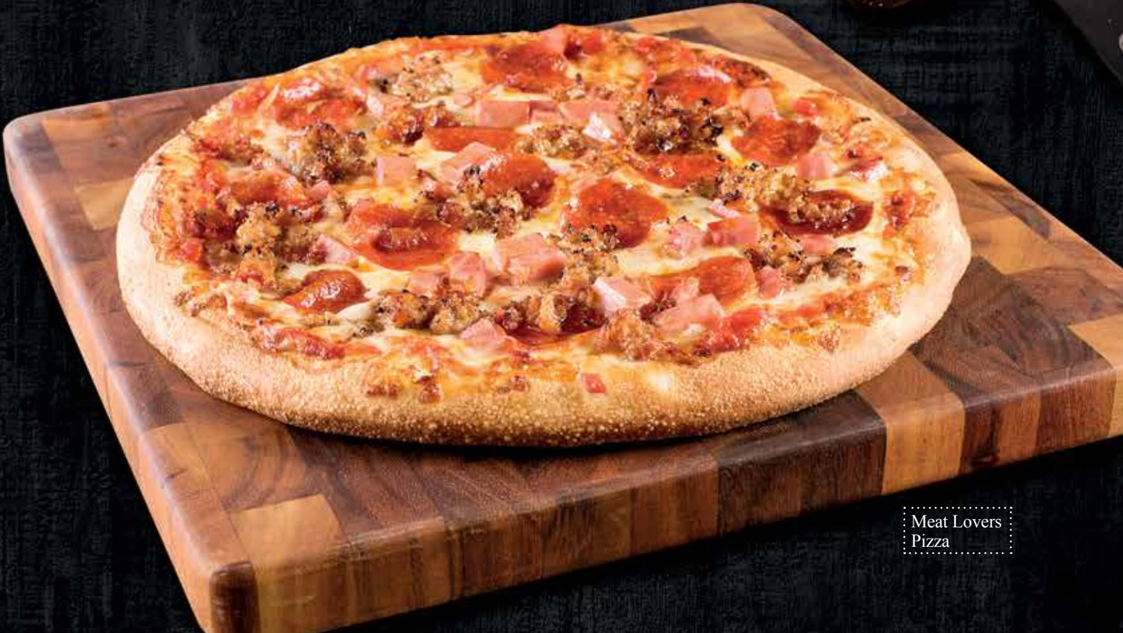
Meat Lovers Pizza