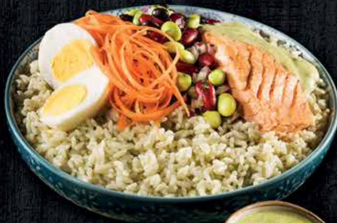
Select Salmon Bowl

Southwest grilled chicken tenderloin, cilantro lime rice, black beans, corn, red onions, and cherry tomatoes. Served with chipotle ranch dressing.