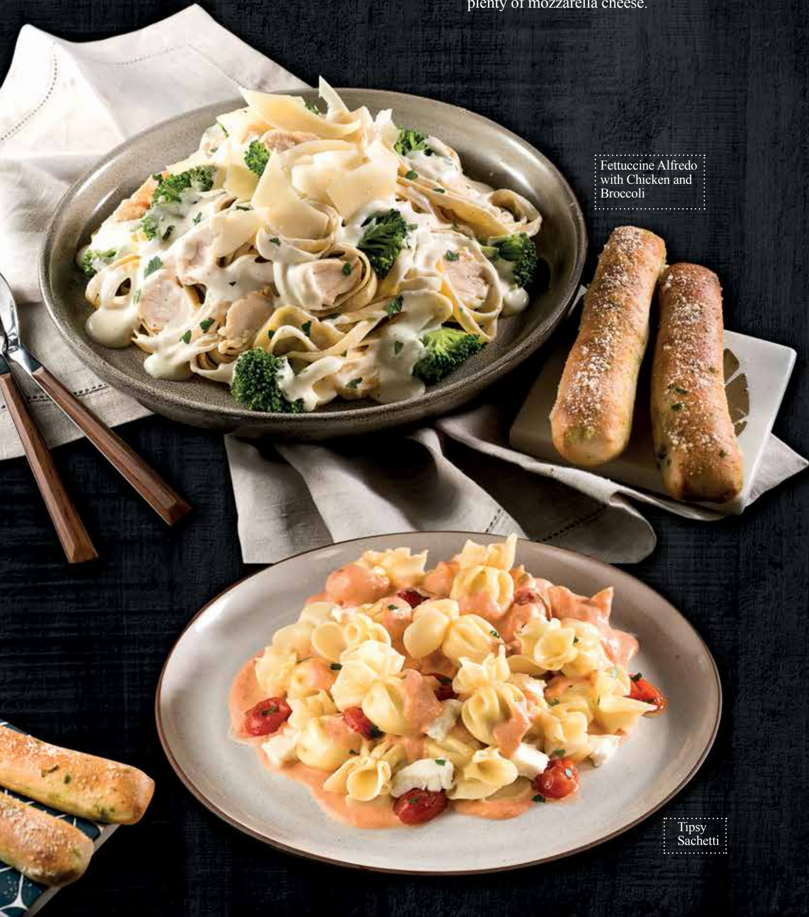
Fettuccine Alfredo with Chicken and Broccoli