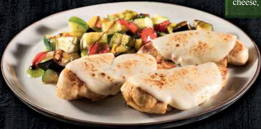
Glazed Mediterranean Chicken

New Orleans Shrimp & Sausage 18.99 Shrimp, sausage, onions and sweet peppers sautéed in a spicy red sauce over penne pasta.