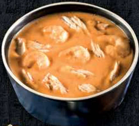
Shrimp & Crab Bisque