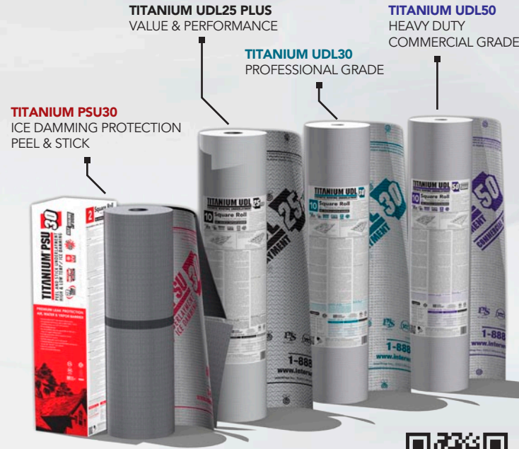
TITANIUM PSU30 ICE DAMMING PROTECTION PEEL & STICK

For more information on our line of Titanium synthetic roofing underlayments visit: www.InterWrap.com/Titanium