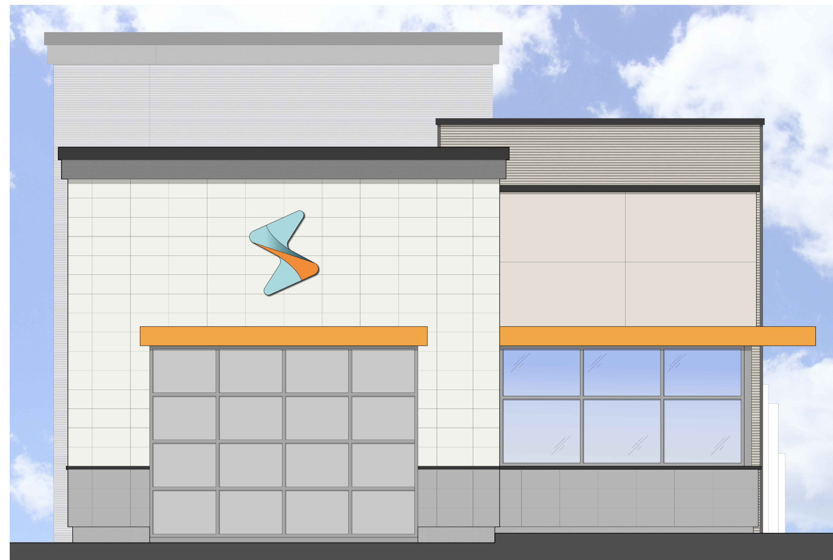
2 PROPOSED SOUTH ELEVATION N.T.S.