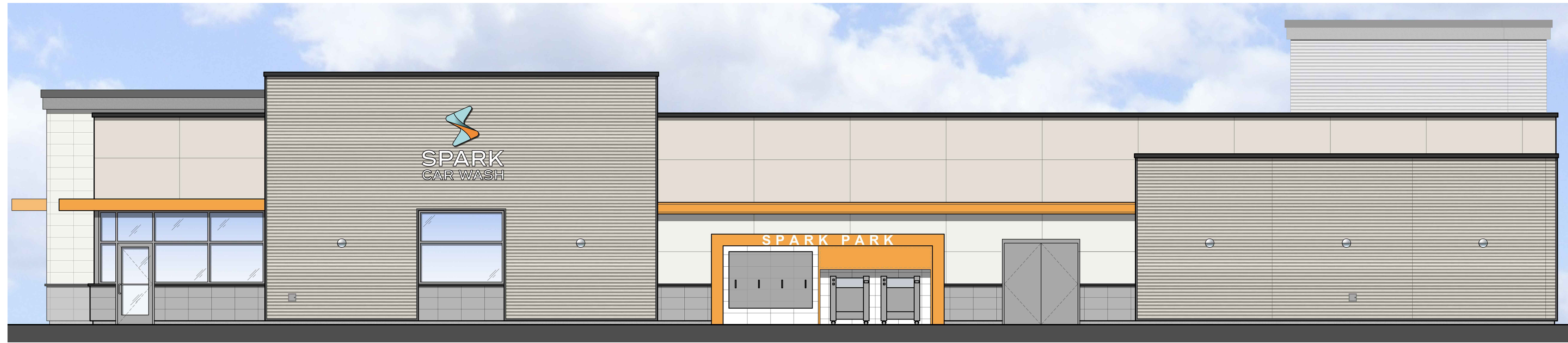
1 PROPOSED EAST ELEVATION N.T.S.