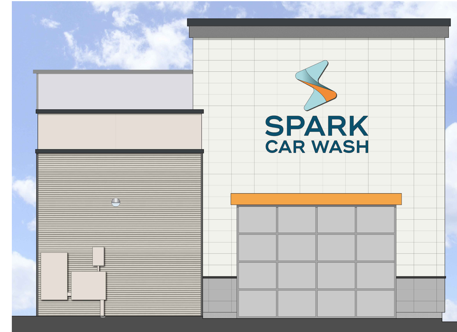
3 PROPOSED NORTH ELEVATION N.T.S.