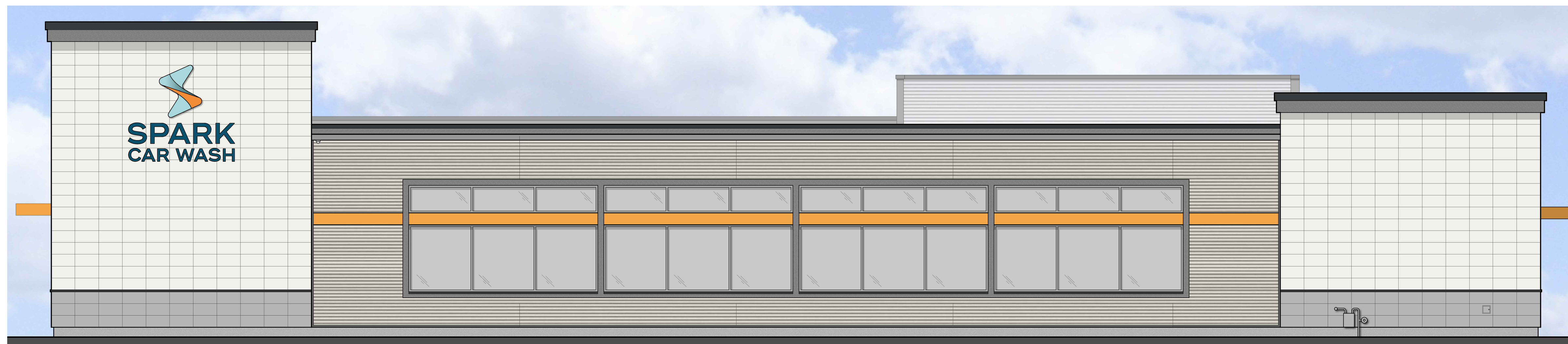
4 PROPOSED WEST ELEVATION (Lighthouse Drive) N.T.S.