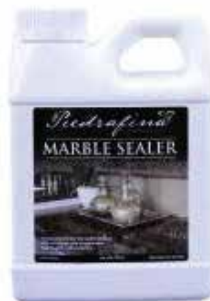
1 PINT SEALS 200 square feet