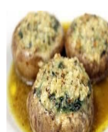
lamb chops mini