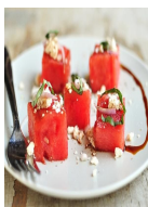
Watermelon & feta