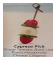
stuffed cherry tomato