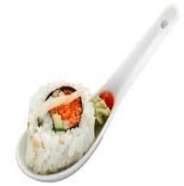
california roll /spoon