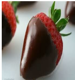
CHOCOLATE DIPPED STRAWBERRY