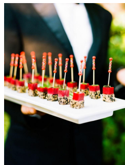
tuna tartare squares