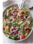
ORange & goat house