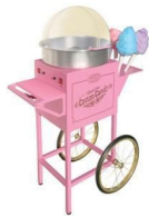
Vintage Cotton Candy Maker w/Umbrella