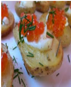
stuffed mini potato