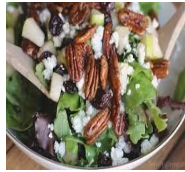
PEAR, blue cheese & nut