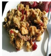
rice & vermicelli