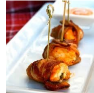
mini chicken & jalapeno /bacon