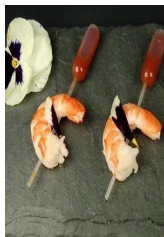
shrimp with pipette