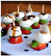
Greek salad pick