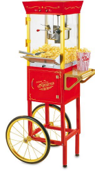
vintage popcorn machine