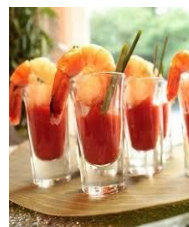
shrimp & grits