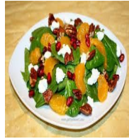
apple blue cheese