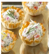
cold crab cups