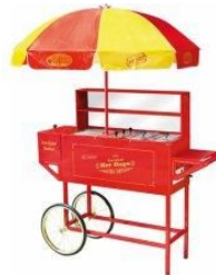
Carnival Hot Dog Cart