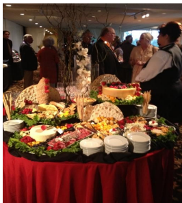
fruit & cheese display a specialty add on