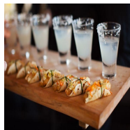
mini chicken taco's with mini drink