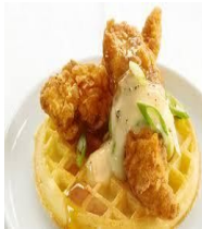
chicken & waffles