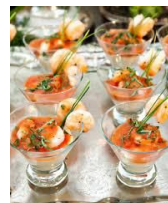
display of shrimp shooters