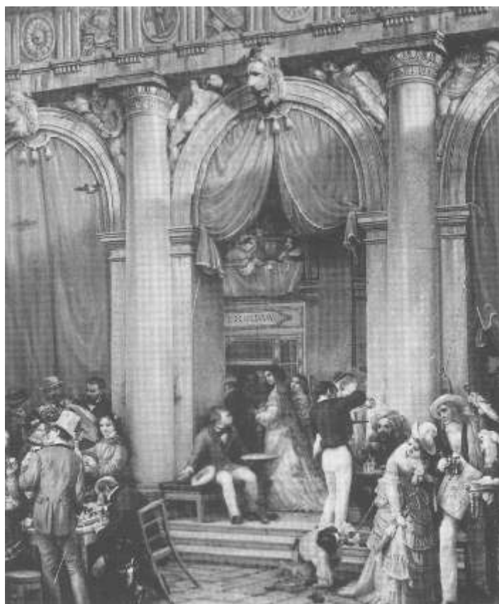
Drinking coffee on the steps of the Caffé Florian, in Venice since 1720. Early 19th Century drawing.

The Café Intermezzo logo, the name Café Intermezzo , and the word Intermezzo are all registered trademarks of Café Intermezzo, Inc., and are copyright 1980/2018 Café Intermezzo, Inc. All rights reserved.