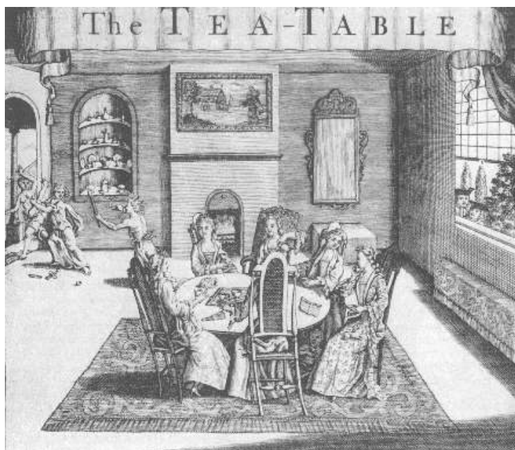
Sitting down to tea in the eighteenth century. In the background Scandal drives away Truth and another allegorical figure in allusion to the conversation taking place around the table.