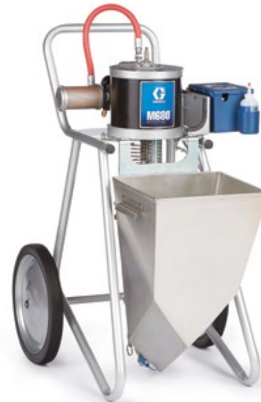
ToughTek M680a CS

The ToughTek M680a piston pump handles abrasive materials such as epoxy mortars, non-skid coatings (bridges and marine industry – solvent based coatings) or cementitious materials, and tackles difficult polymers with fillers such as glass flake, silica or sand. The all stainless design makes cleanup of epoxy mortars easy and worry-free.