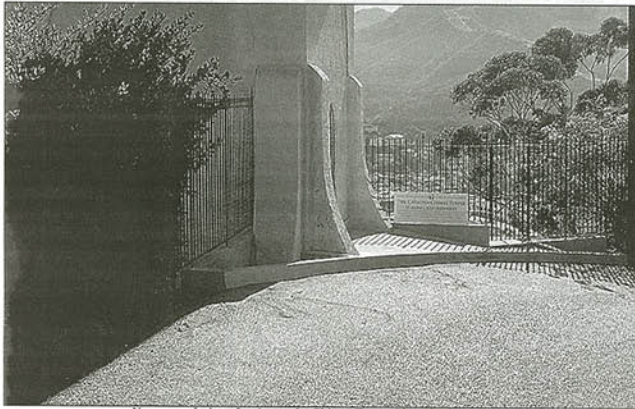
New wrought-iron fencing at the Chimes Tower.

The Catalina Chimes Tower Foundation's restoration of the chimes and surrounding structure has reached another important milestone with the installation of hand forged iron work, which provides increased visibility of the historic Deagan Chimes.