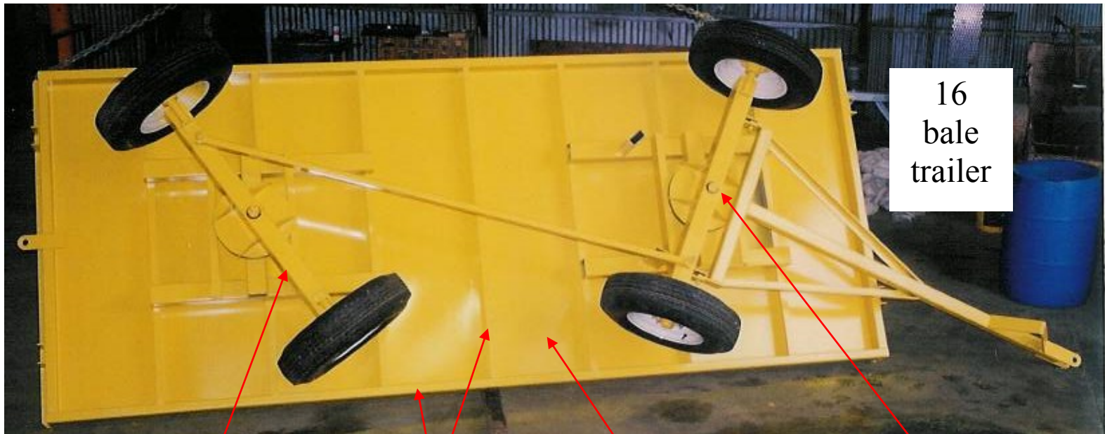
16 bale trailer

When we say, “ BUILT LIKE A TANK ”, we mean it! Our family has been in the cotton industry for over 60 years . We know how hard employees can be on equipment, so we designed these trailers to withstand all the punishment they can dish out!