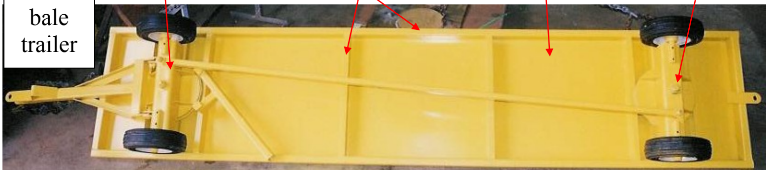
8 bale trailer